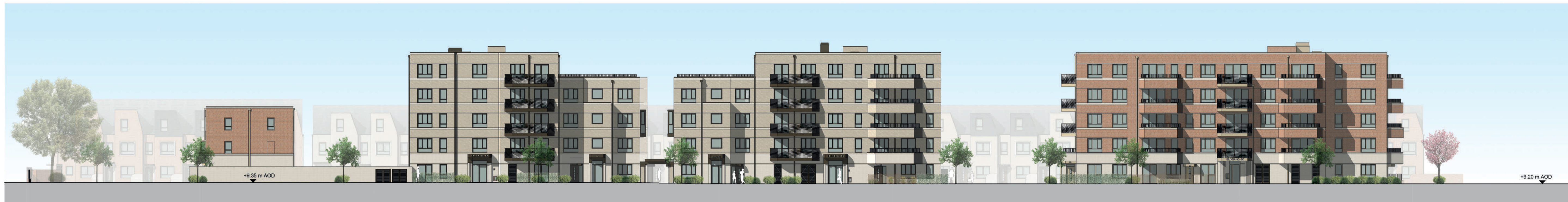
Section A 1 : 250