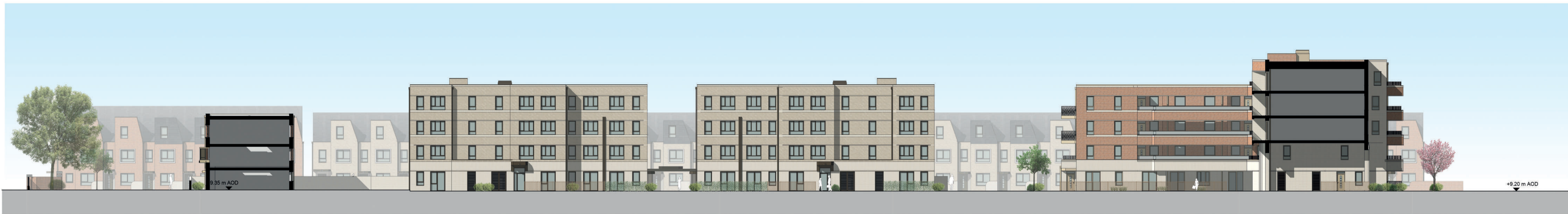
Section B 1 : 250