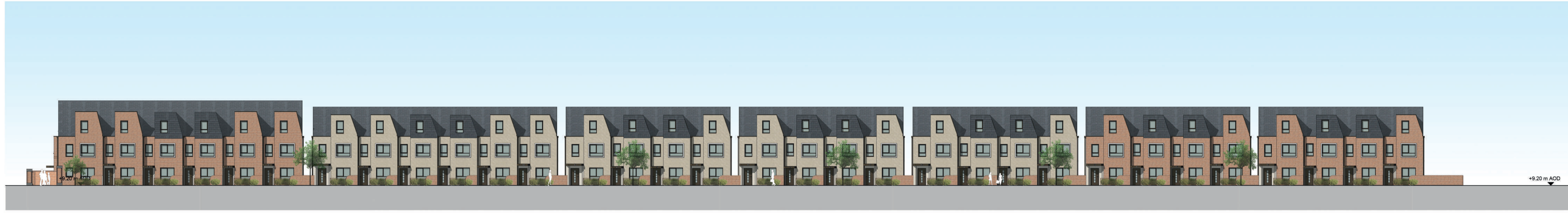
Section C 1 : 250