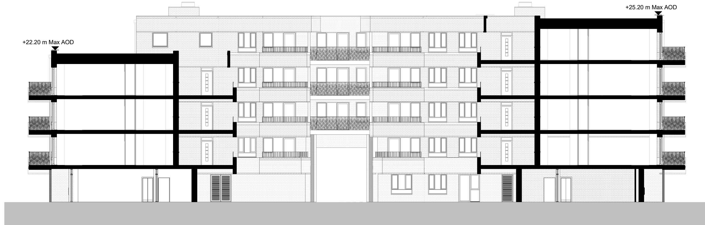
Site Section A-A 1 : 200