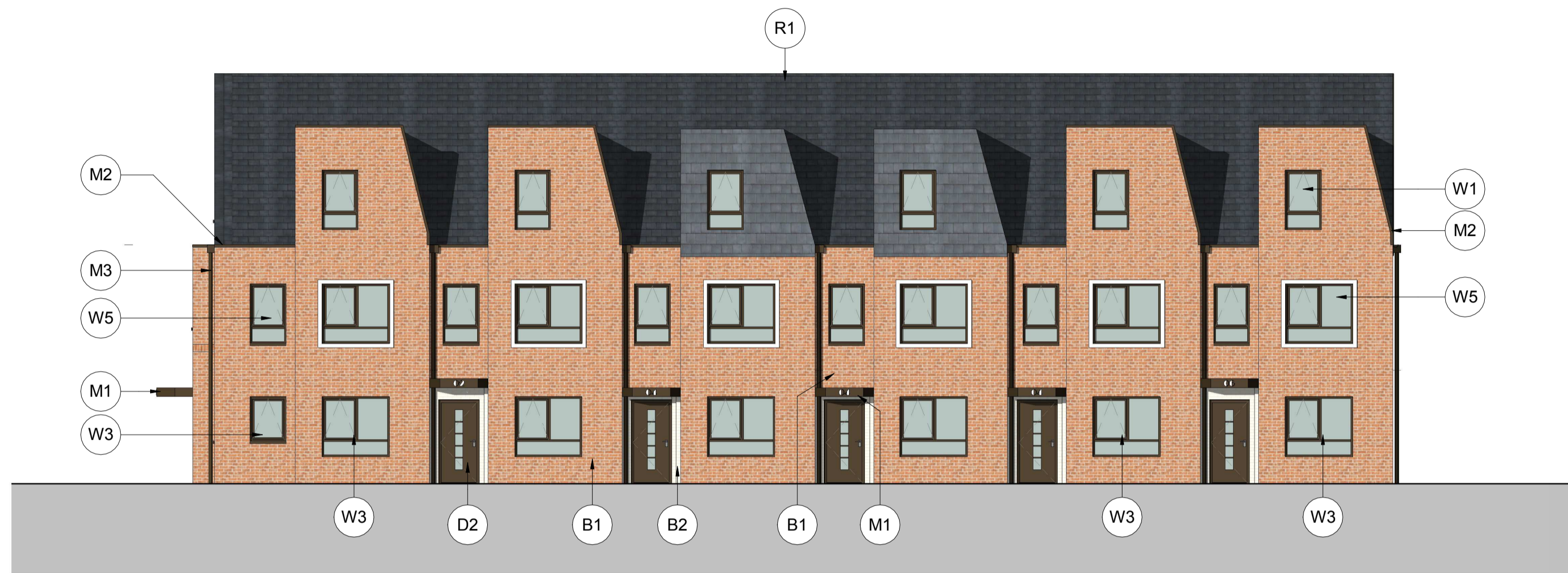
Elevation A 1 : 100