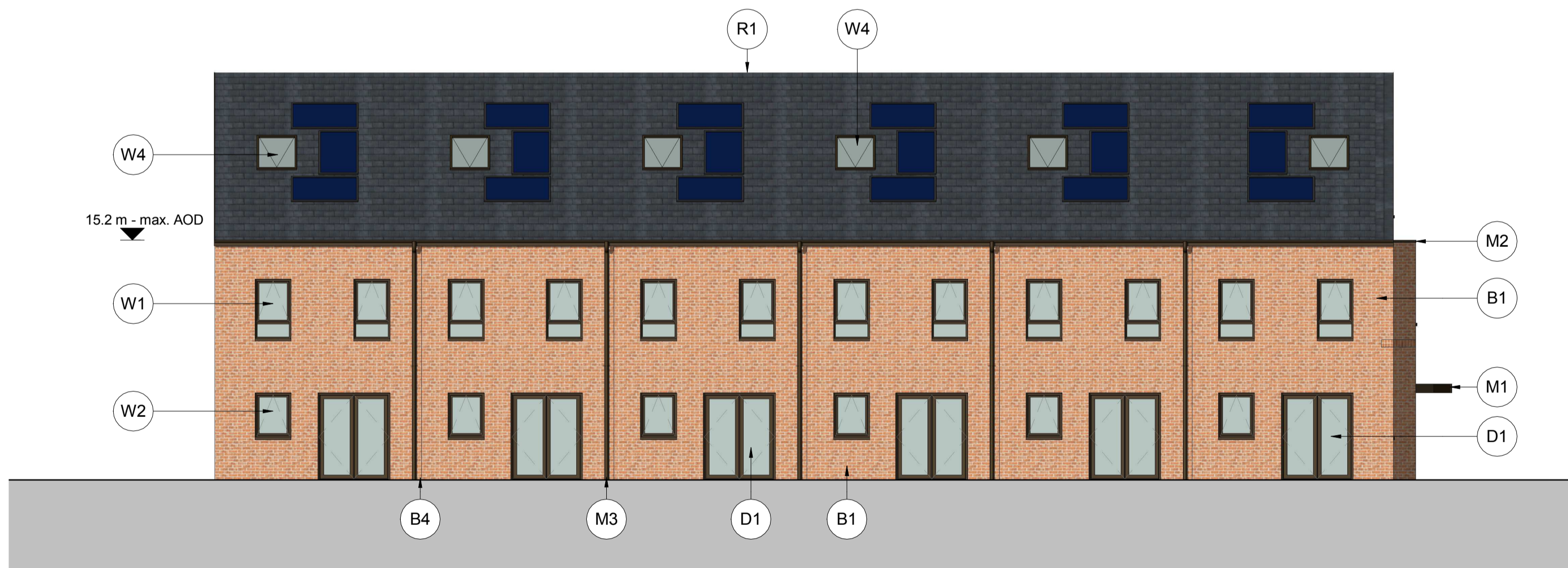
Elevation C 1 : 100