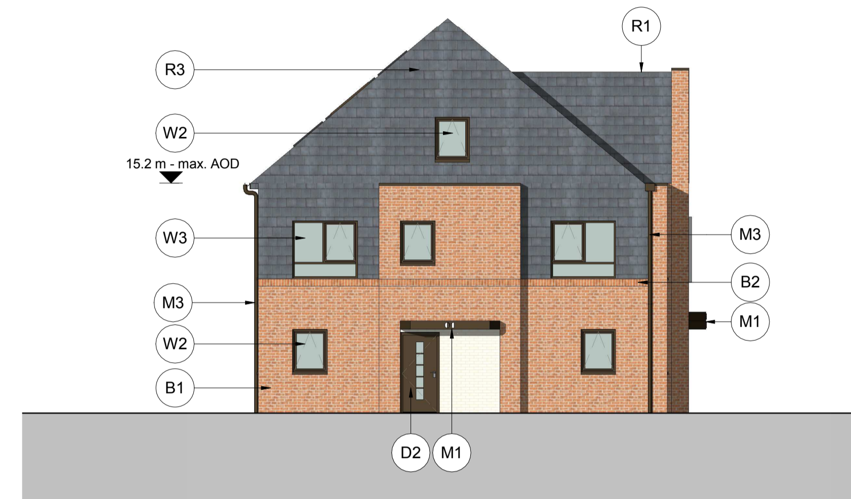
Elevation B 1 : 100