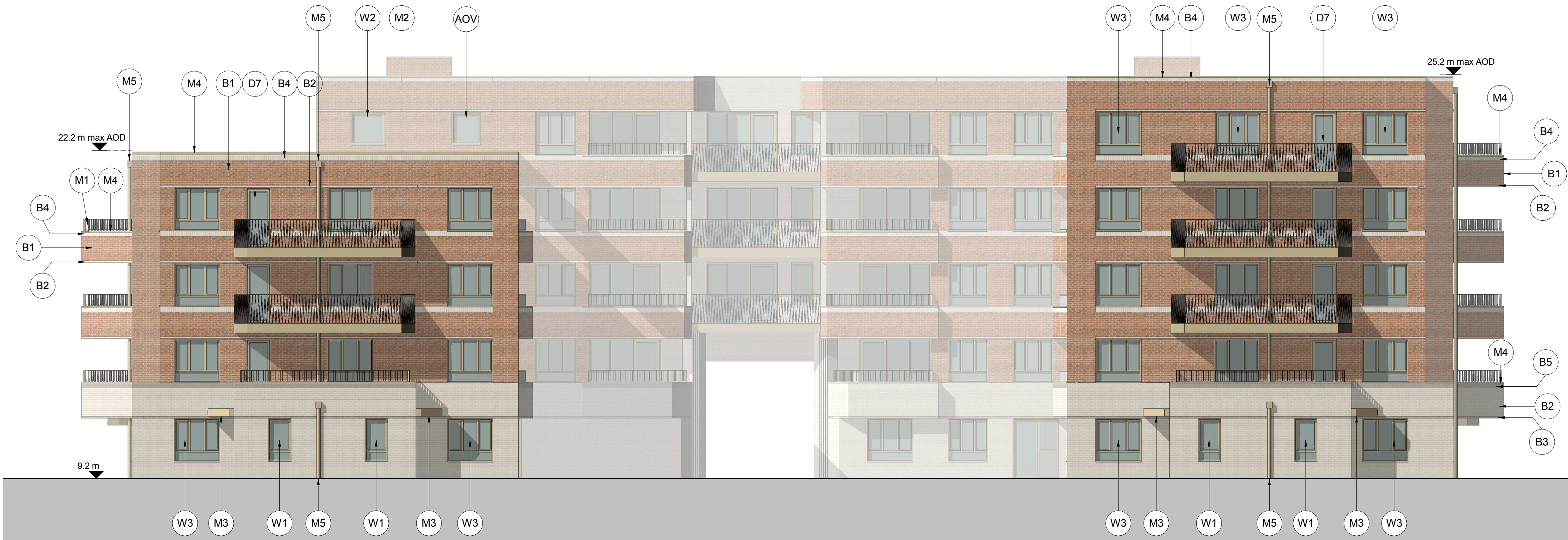
Elevation D - Cross Road