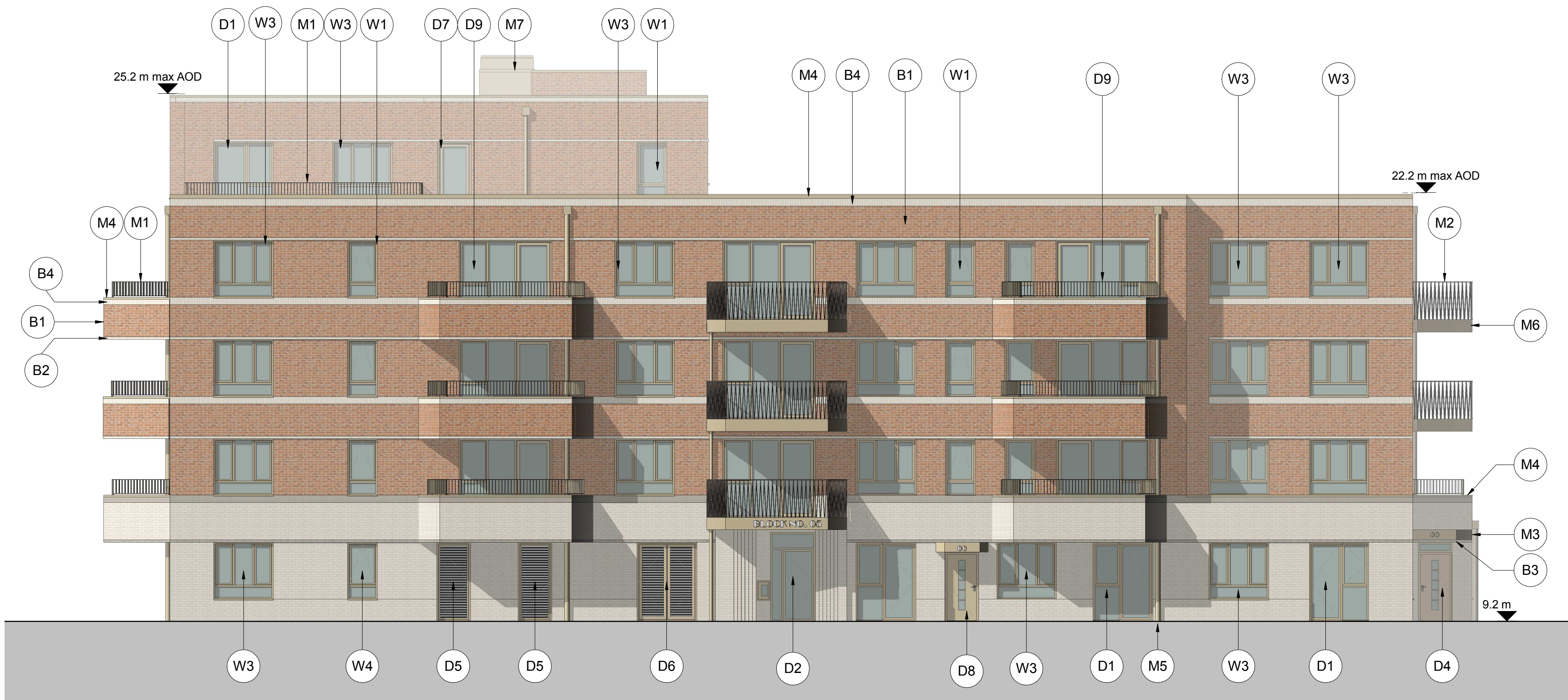
Elevation E - South Road