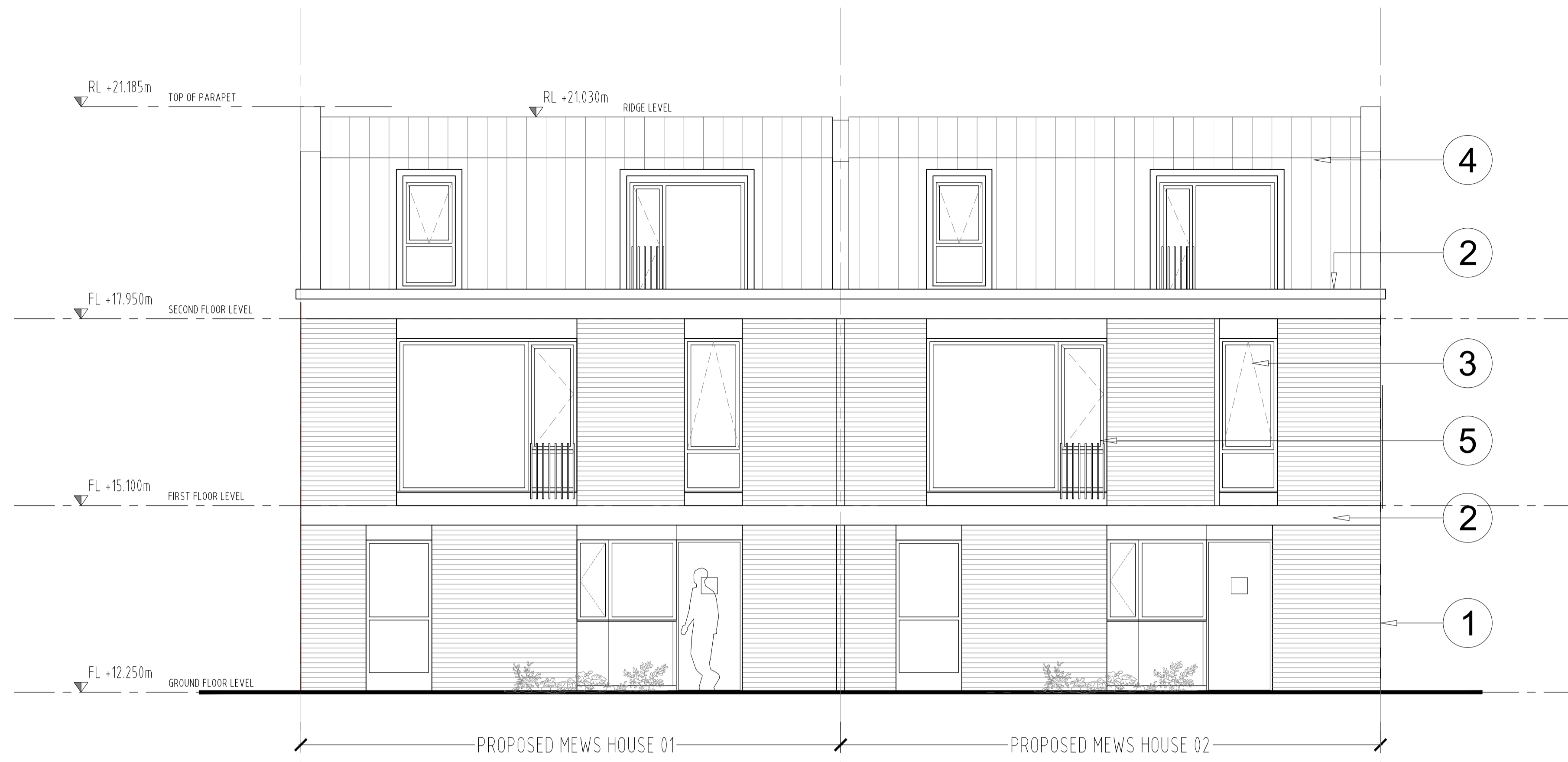
01 FRONT ELEVATION - PROPOSED SCALE 1:50 @ A1