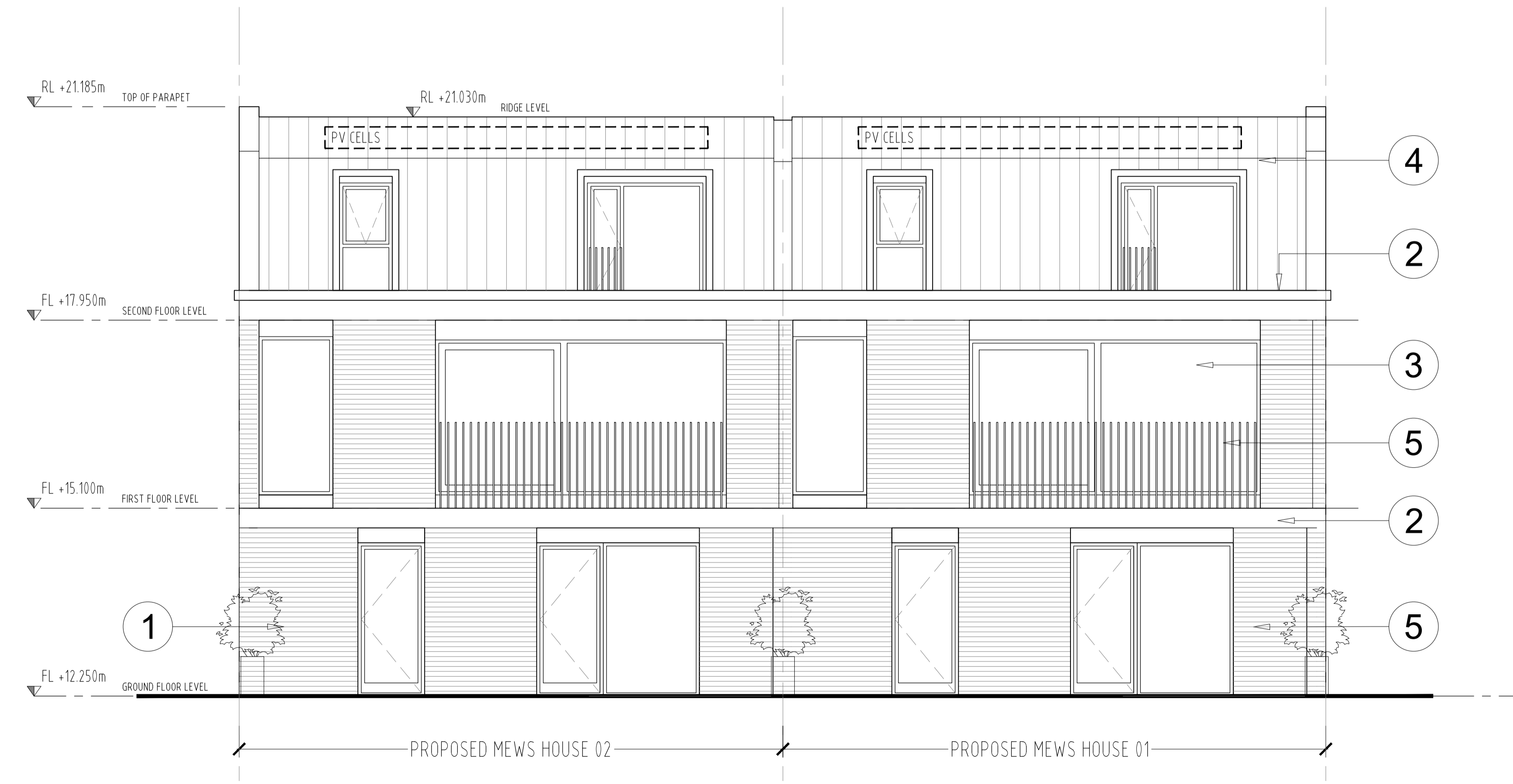
02 REAR ELEVATION - PROPOSED SCALE 1:50 @ A1

GENERAL NOTES - EXISTING GARAGE PLAN BASED ON THE FOLLOWING INFORMATION RECEIVED: - MAKODA DESIGNS ARCHITECTS DRAWINGS (MDL-1252-PL11, MDL-1252-PL01) - OS MAP 01053187 PURCHASED ON 25.10.2016 - SITE OWNERSHIP (TITLE PLAN) RECEIVED FROM THE CLIENT 16.11.2016 - MEASURED SURVEY BY MK SURVEYS 26.04.2017