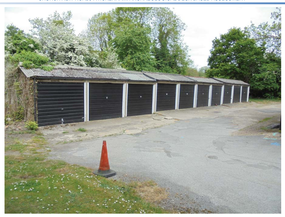
Plate 1: Garages proposed for development