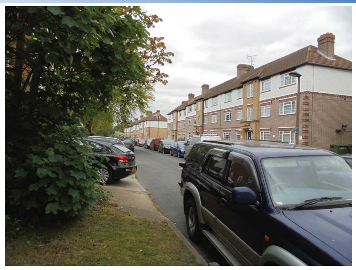
Plate 3: View towards development site from Site 3: Church of All Saints