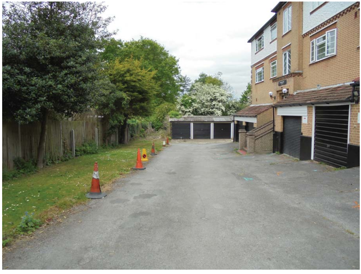
Plate 2: Garages at end of Churchview Road