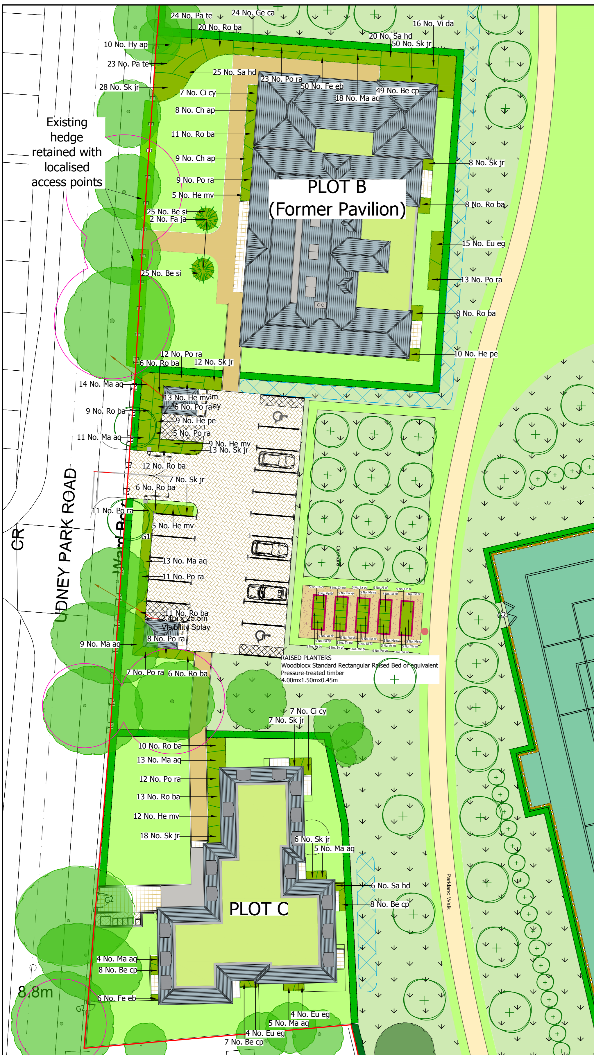
Plot B & C: Scale at 1: 250 @ A1