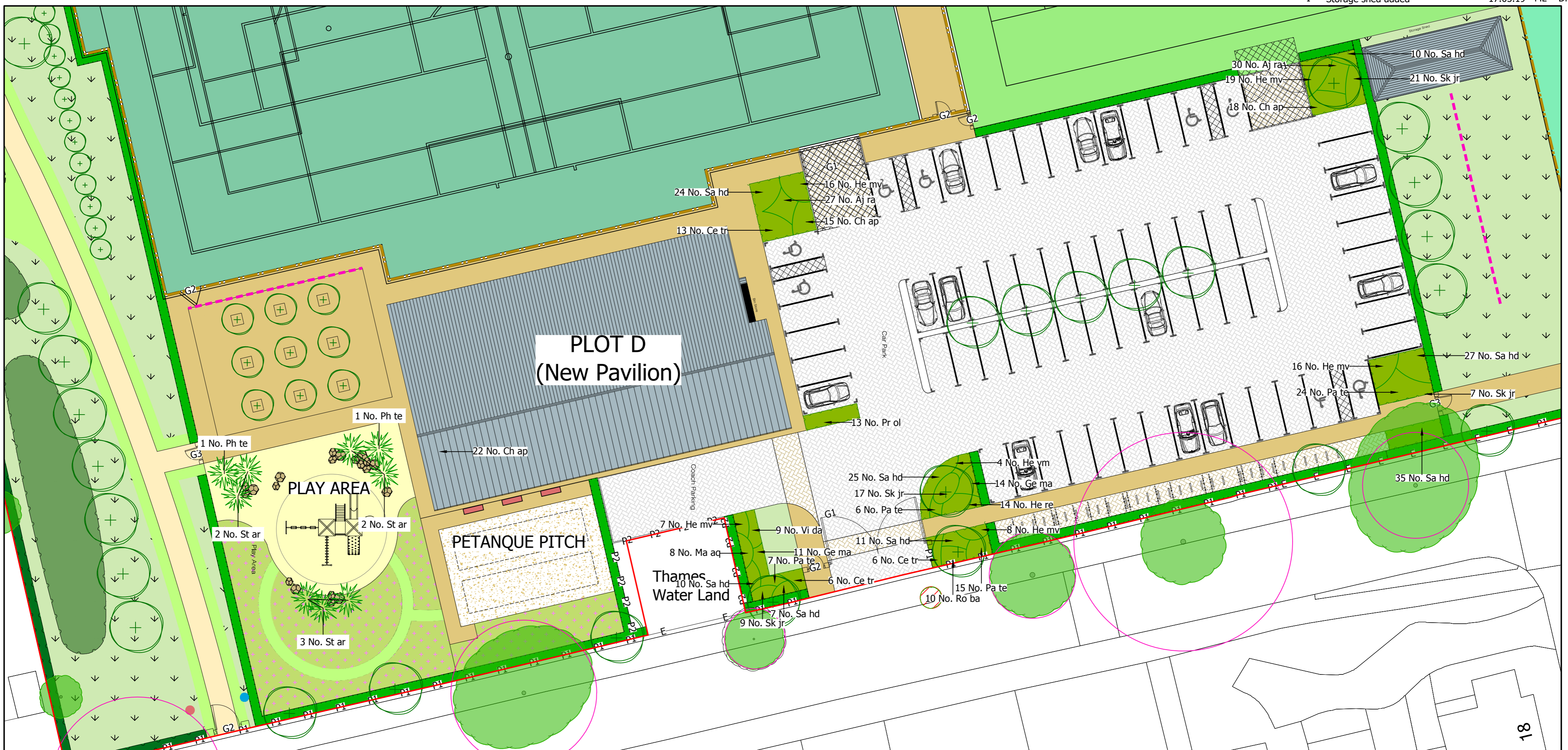
Plot D Scale at 1: 250 @ A1