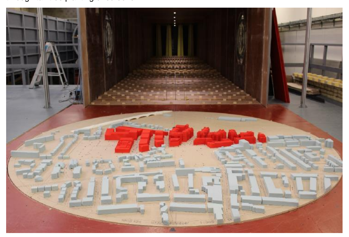
Photograph: Wind tunnel test of the Development with existing surrounds.

It has been identified that if a building entrance were to be located at the west facing façade of Building 16 then this location would be subject to wind conditions that would not be suitable for use. However, as this part of the Development is proposed in outline only, it is considered that this issue be deferred to subsequent reserved matters applications in respect of Building 16. This issue could be addressed in the future by either not proposing a building entrance at this location, recessing the building entrance or through tall tree planting or screens.