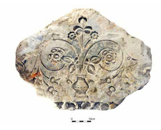
Photograph: Carved stone recovered from archaeological fieldwork undertaken at the Site.

There would be no likely effects on archaeological assets once the Development is complete and occupied.