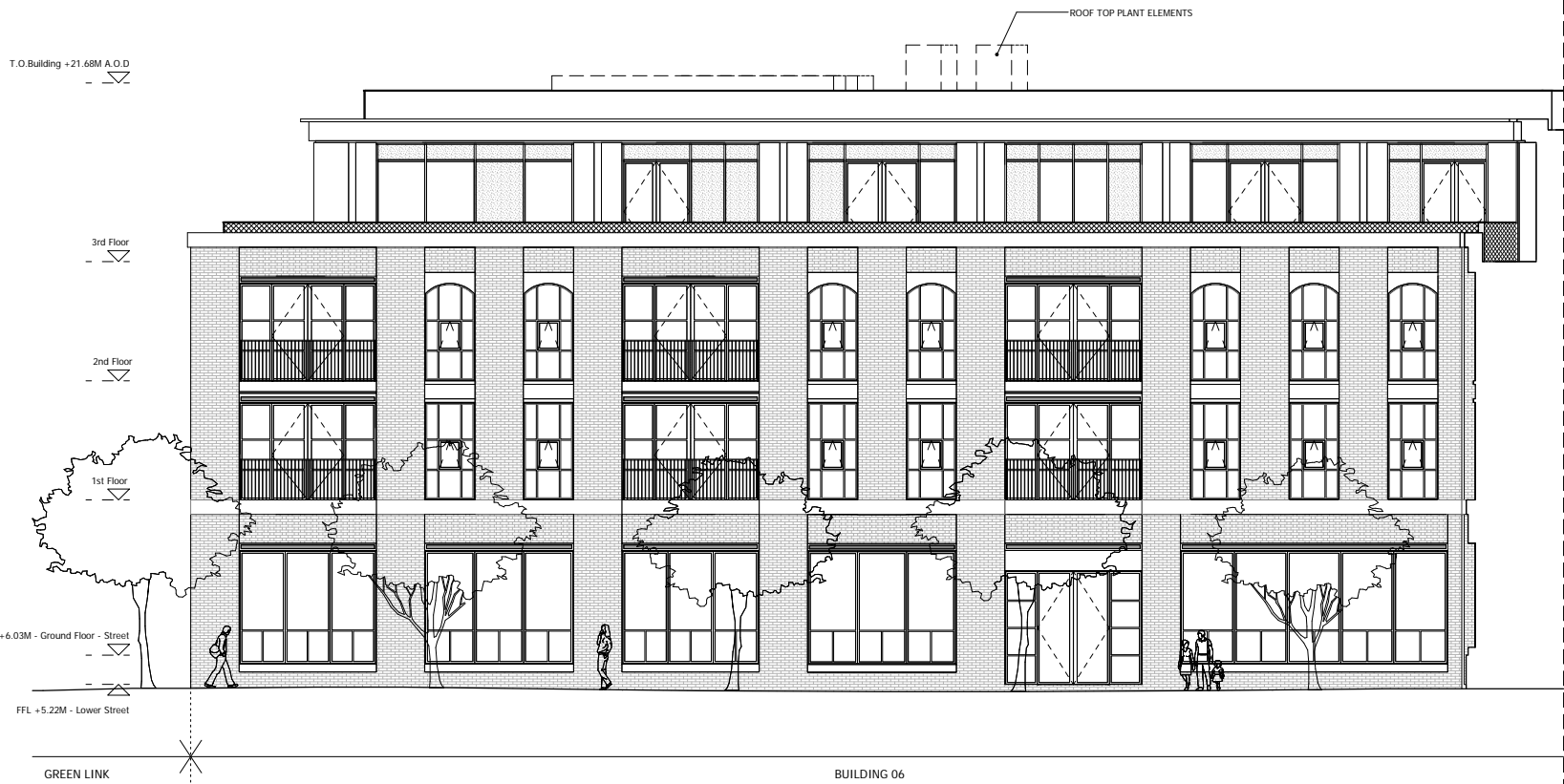
1 PROPOSED SOUTH ELEVATION 01 1 : 100