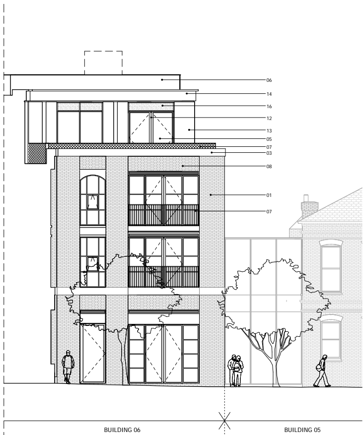
2 PROPOSED SOUTH ELEVATION 02 1 : 100