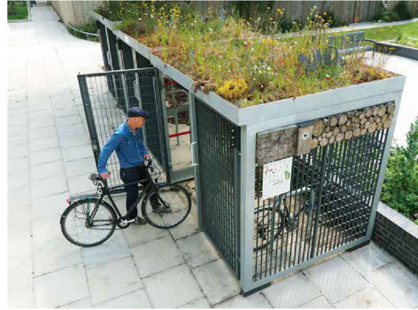
Cladding welded metal panels with double leaf swing doors to match