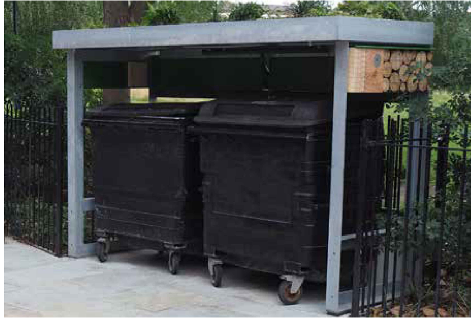
Green roof supported on galvanised posts and frame