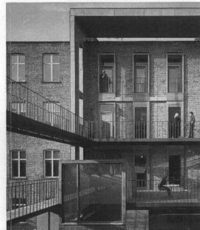
OFFICES, FITZROVIA - BUSCHOW HENLEY