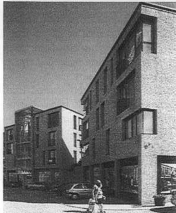
BENNET'S COURTYARD - MERTON - FEILDEN CLEGG BRADLEY