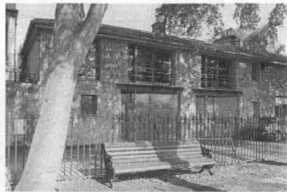
CLYDE LANE MEWS - IRELAND