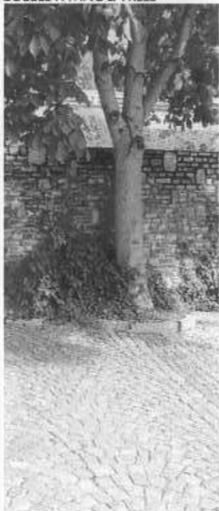
TYPICAL MEWS SPACE