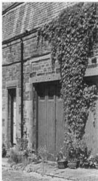
TYPICAL MEWS SPACE