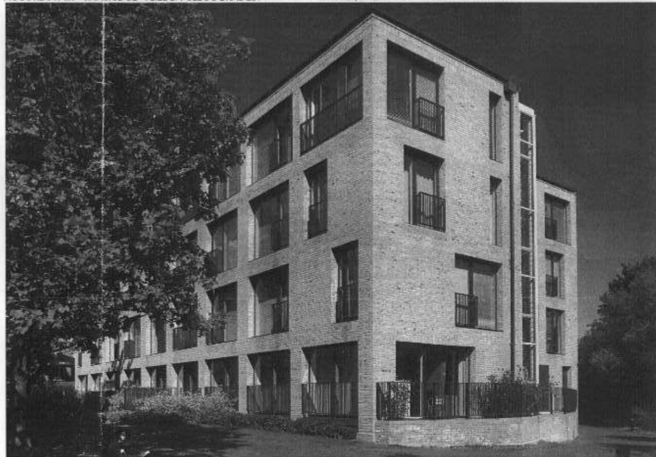
BENNET'S COURTYARD - MERTON - FEILDEN CLEGG BRADLEY