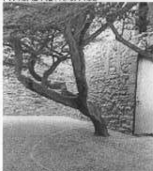
COBBLE PAVING & TREES