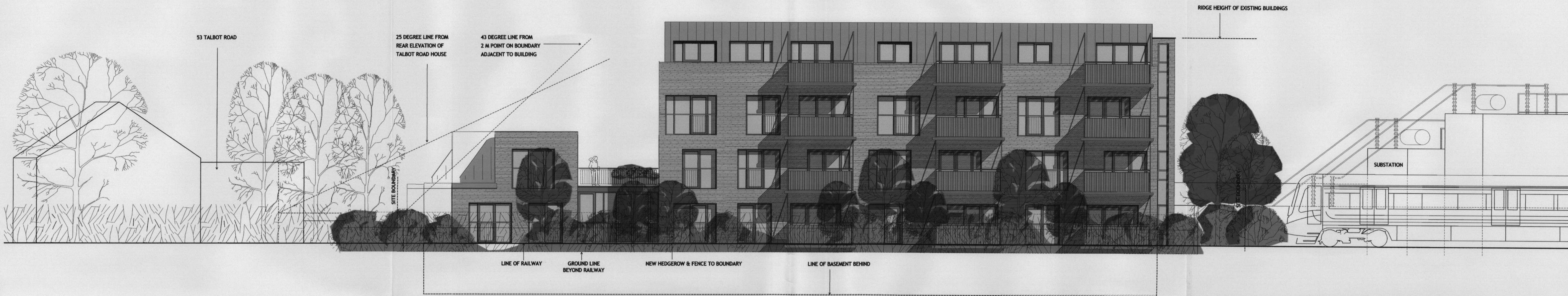
NORTH (RAILWAY) ELEVATION 1:100