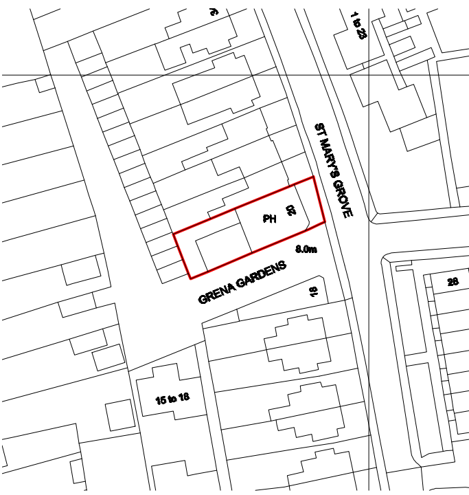
00 KEY PLAN 1:1000