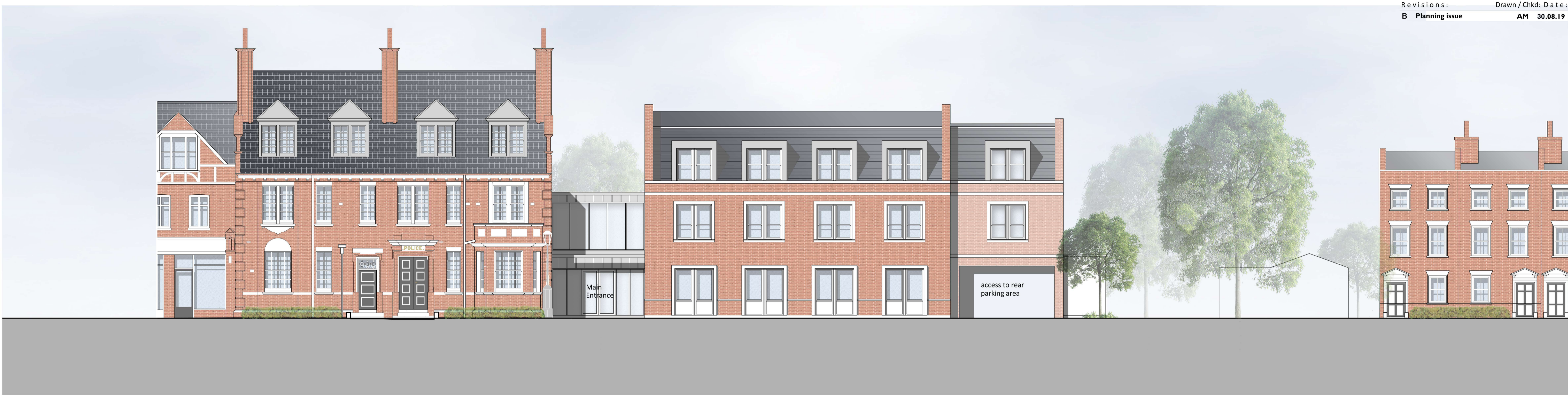
Station Road Elevation - South Elevation 1:100