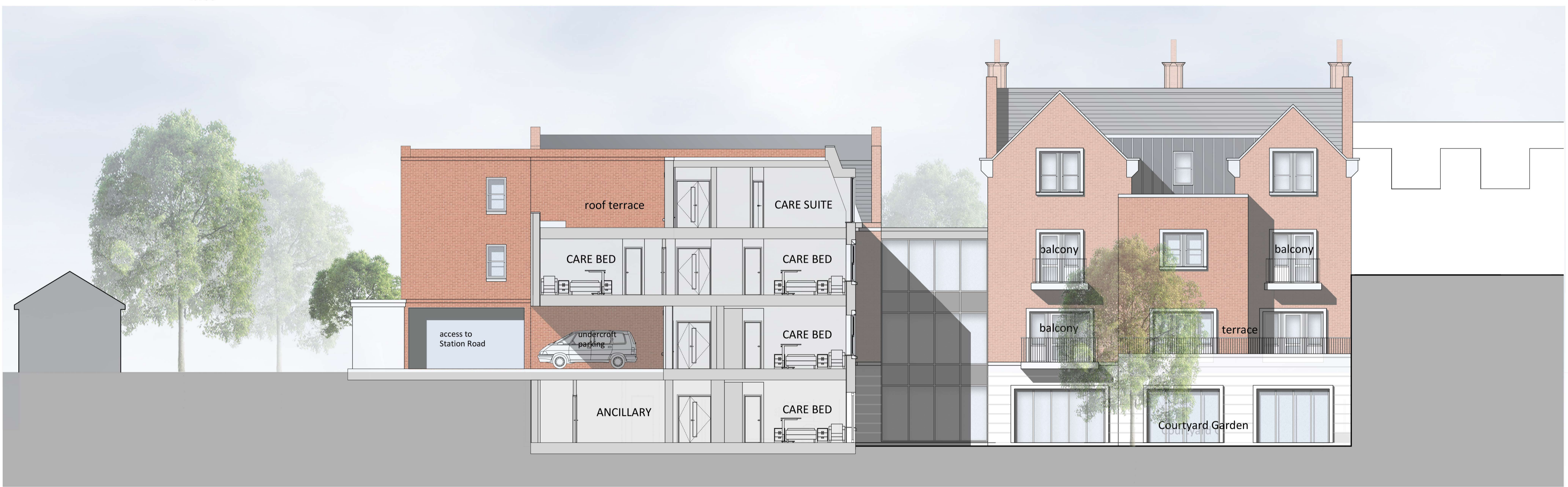
Section A-A - North Elevation through Courtyard Garden 1:100