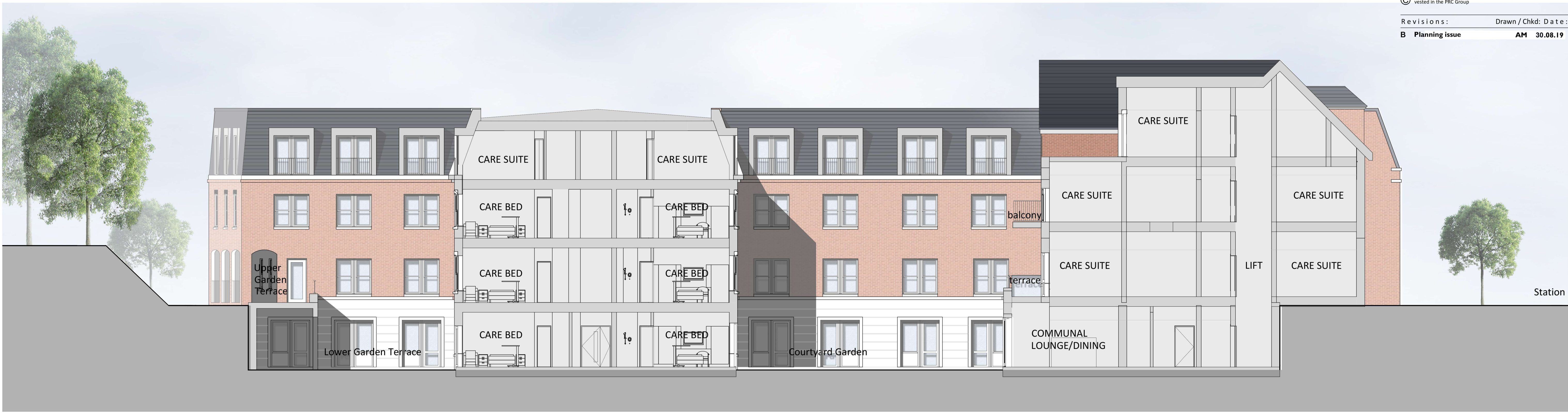
Section B-B - West Elevation / Site Cross Section I:100