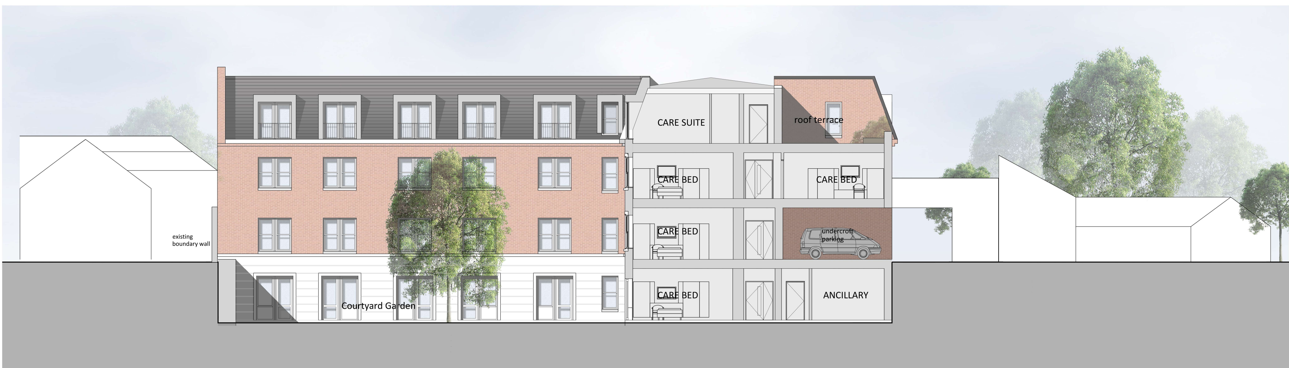
Section C-C - South Elevation through Courtyard Garden I:100