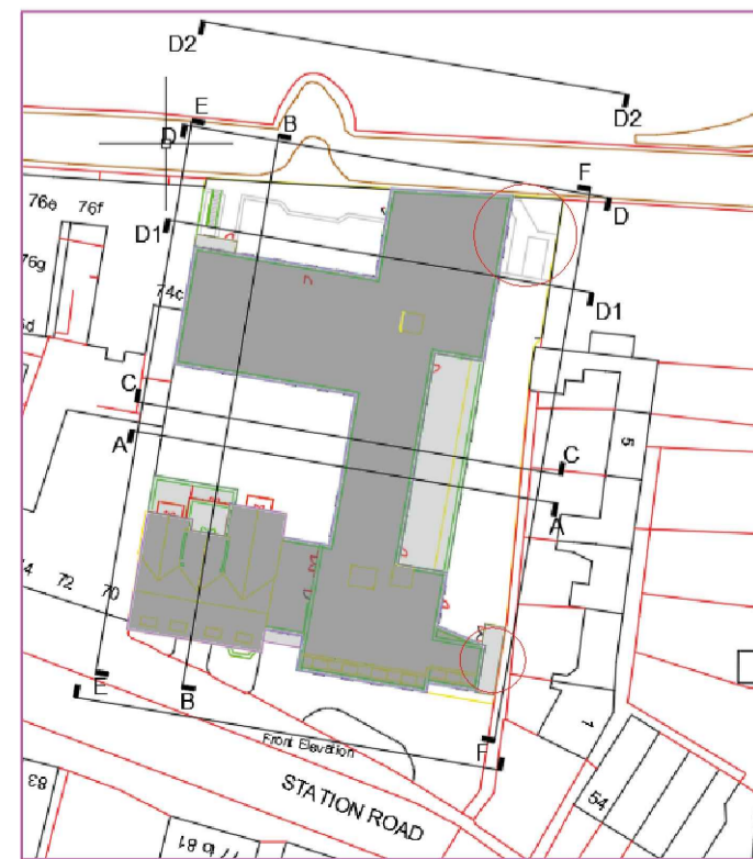
Key Plan 1:1000

This 1:1000 plan shows the location of both the Refuse area and the Cycle area in relation to the site. They can be seen marked with small red circles.