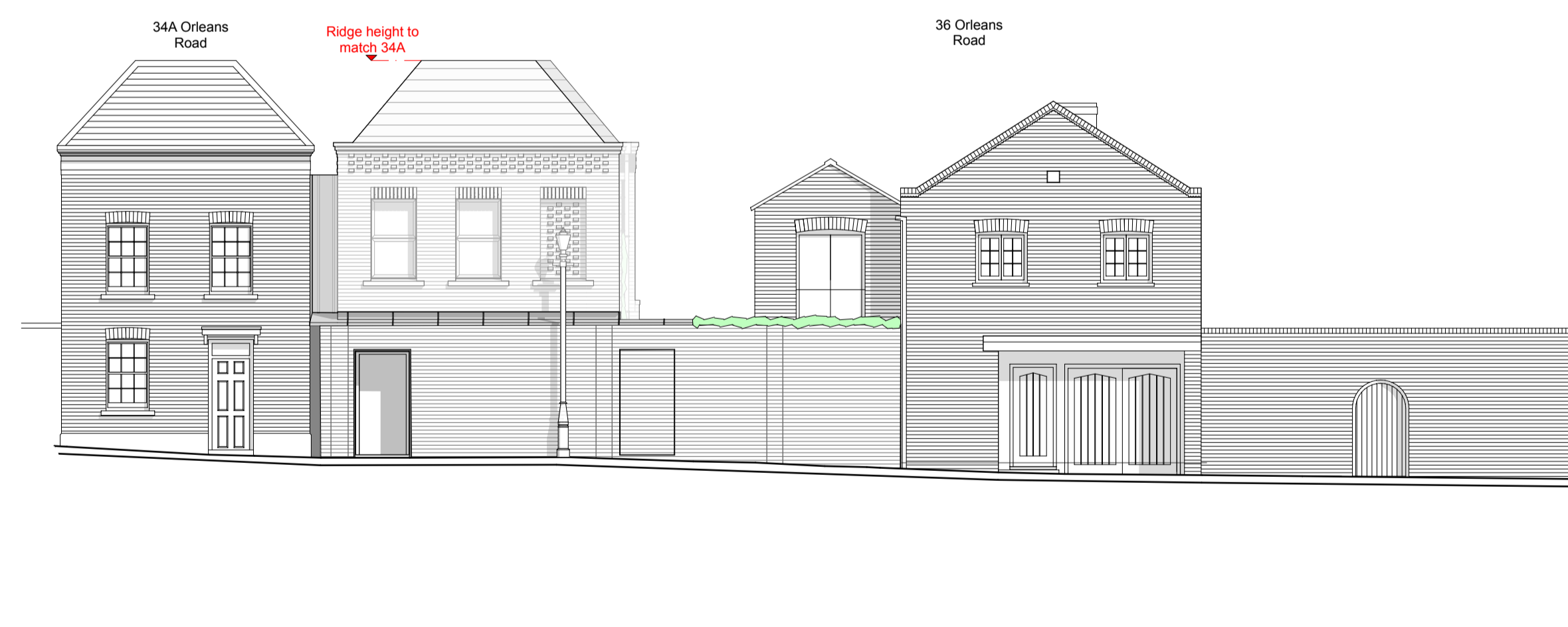
Proposed Front Elevation 1:100 @ A1