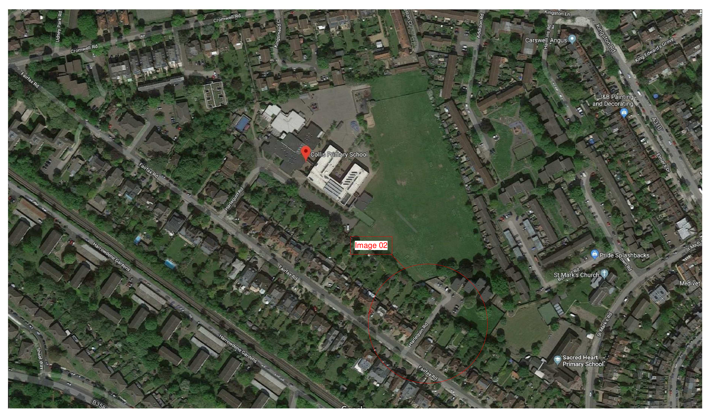
Image 01-SI Existing Site Map 2019-10-23