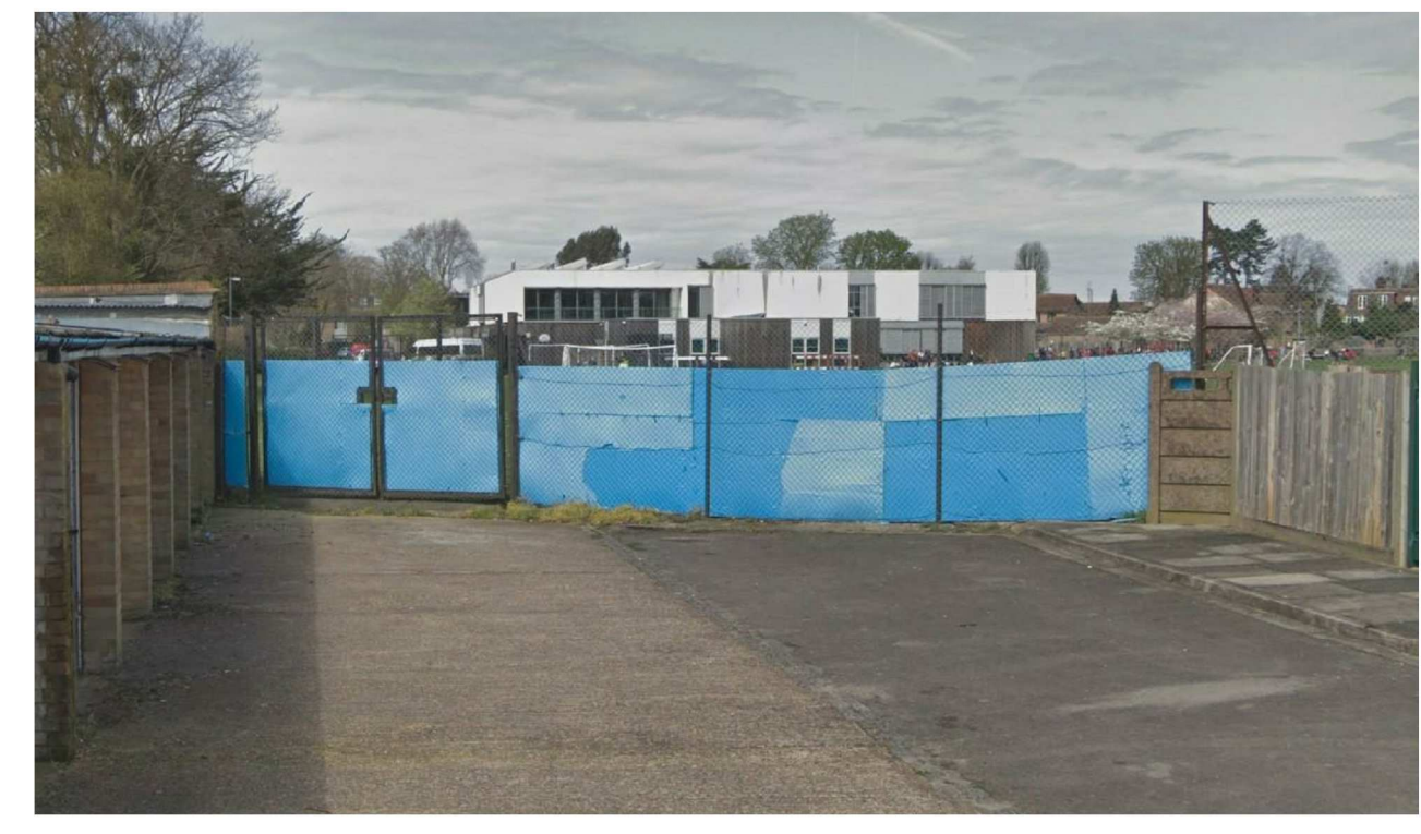
Image 03-SI Existing Site Gate Location 2019-10-23