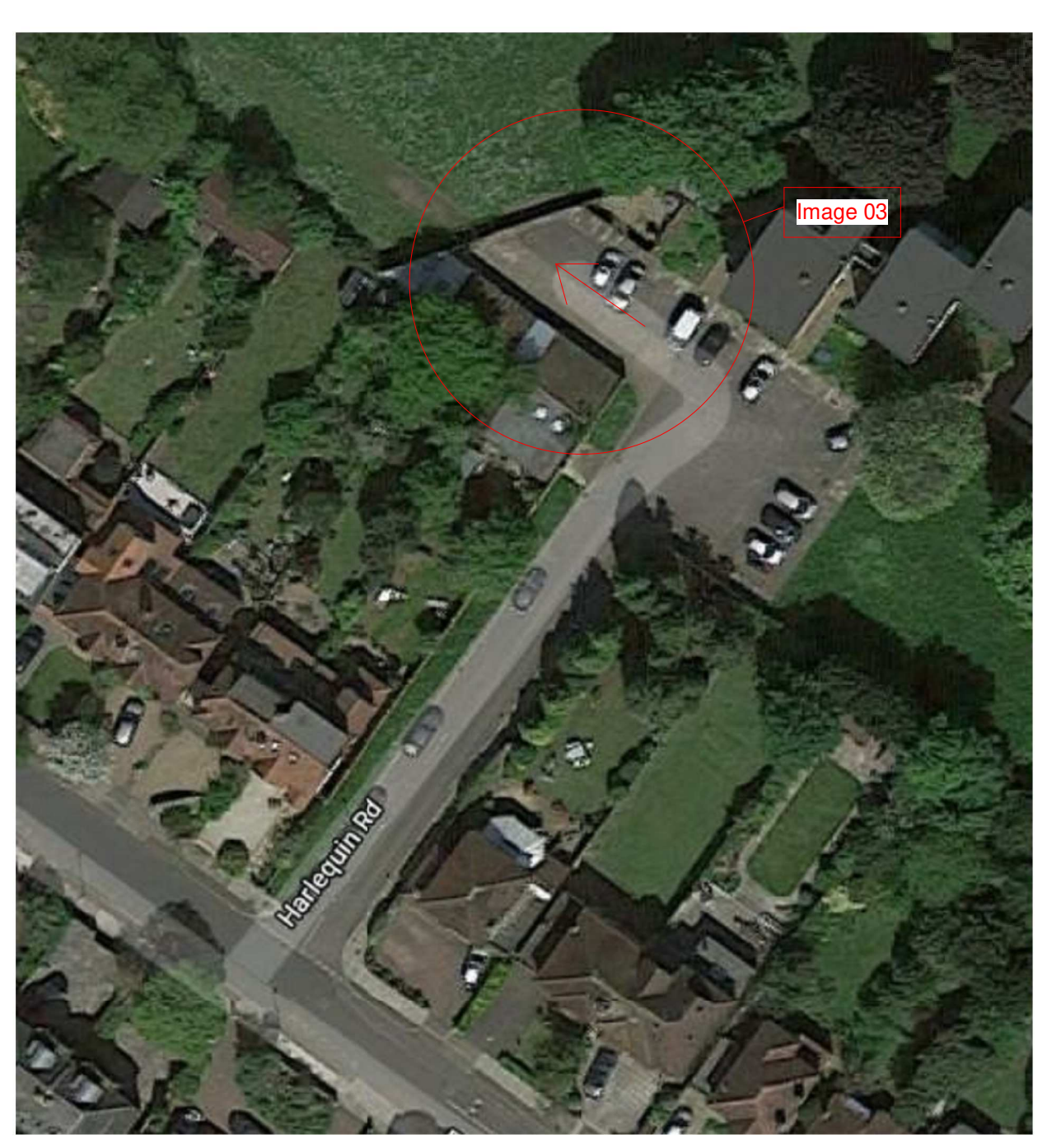
Image 02-SI Existing Site Access Road Image taken from Google Maps 2019-10-23