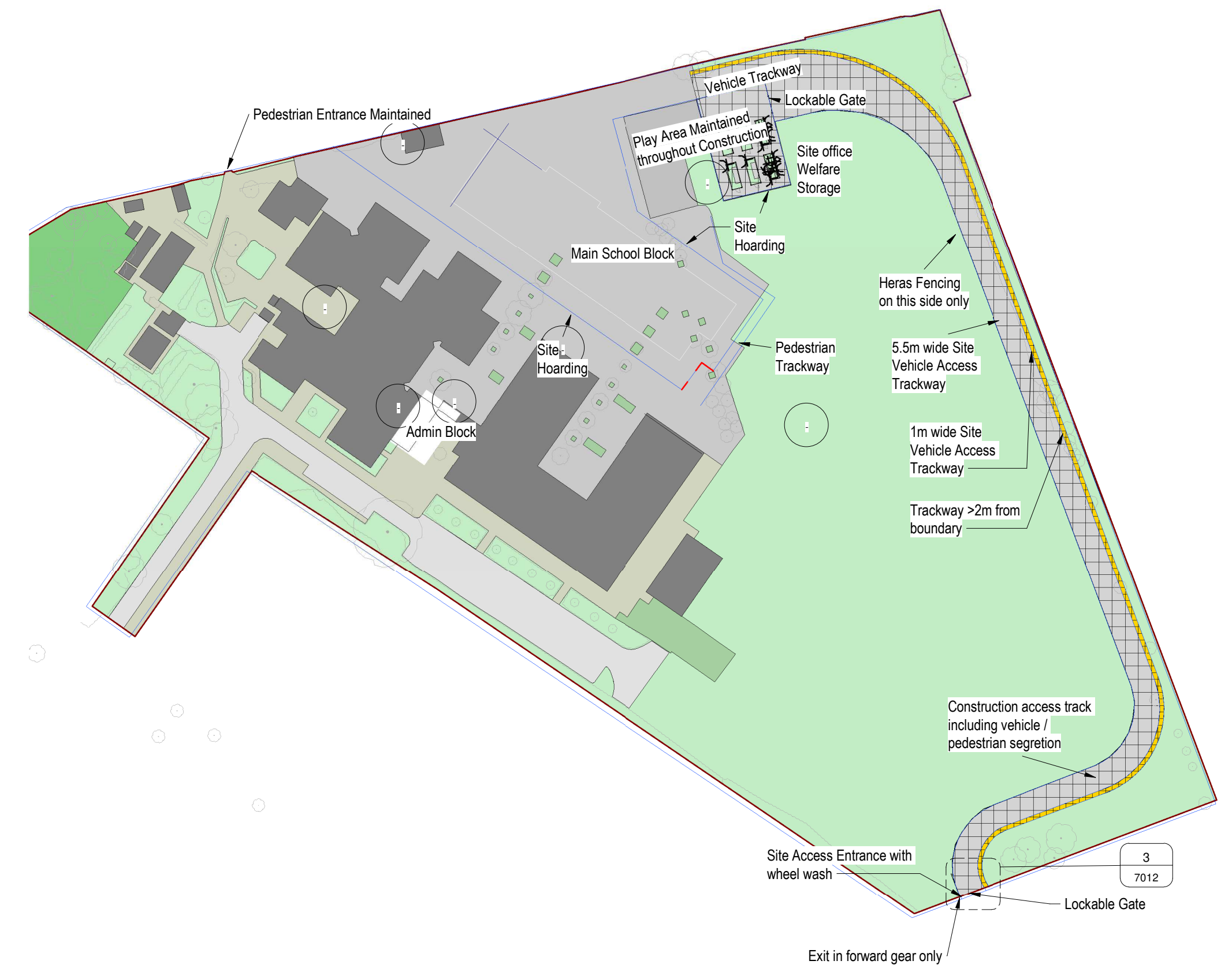
1. SI Construction of Main School Building 1 : 1000