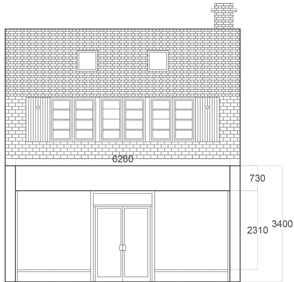
Current Shop Front Elevation