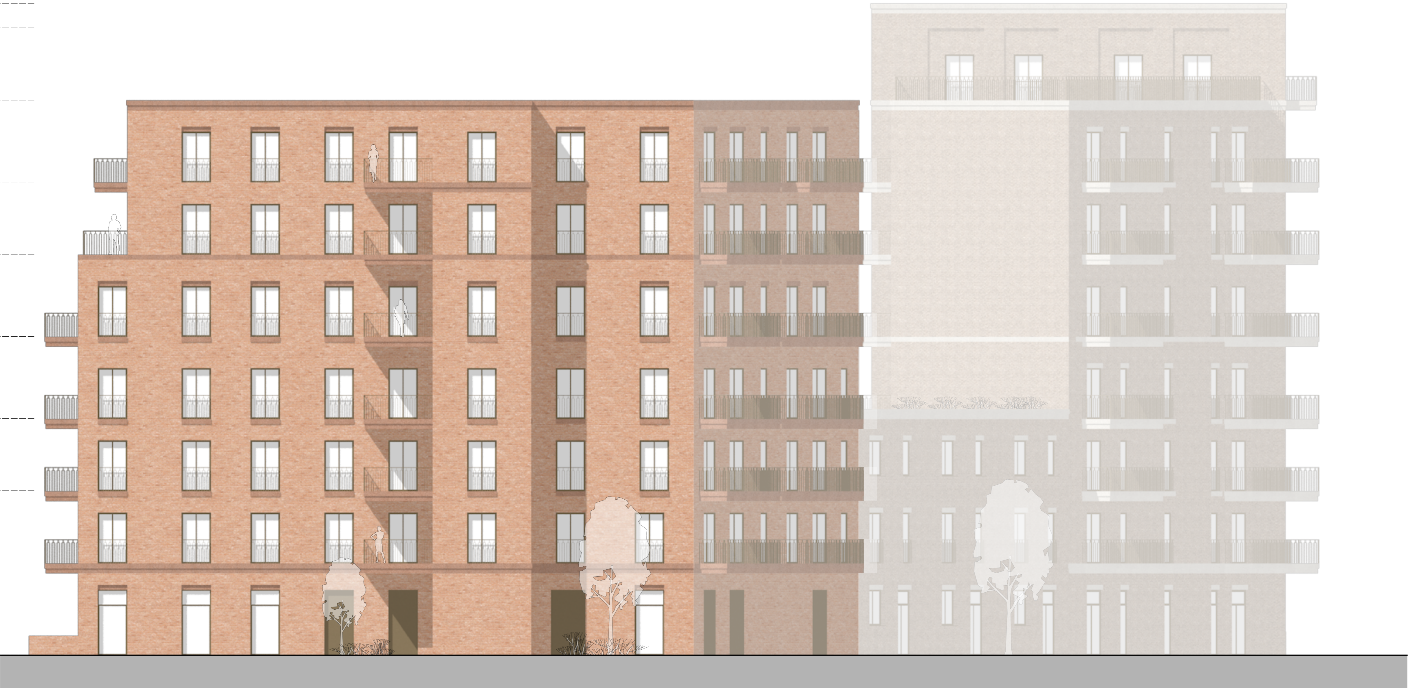
1 Block A North Elevation Scale: 1:100