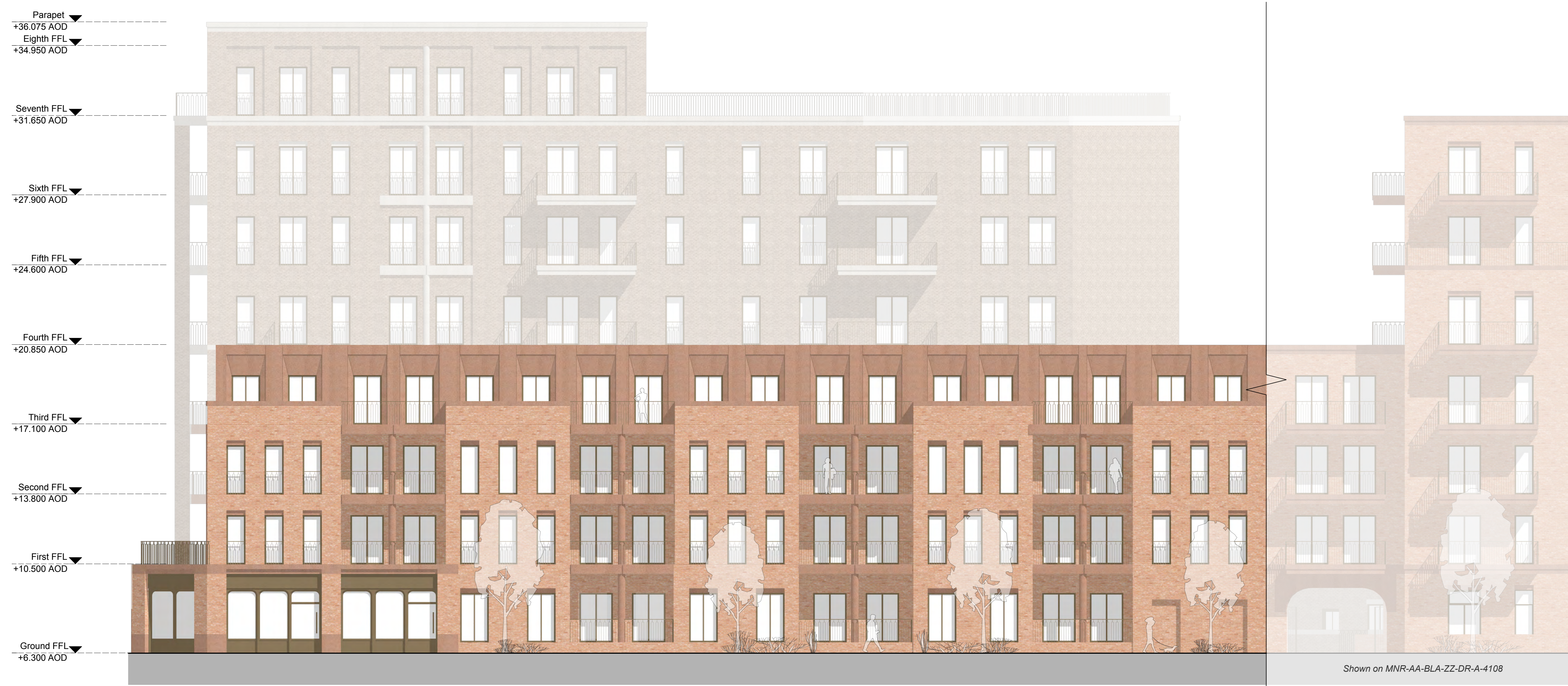
2 Block A East Elevation Scale: 1:100

Assael Assael Architecture Limited 123 Upper Richmond Road London SW15 2TL +44 (0)20 7736 7744 info@assael.co.uk www.assael.co.uk