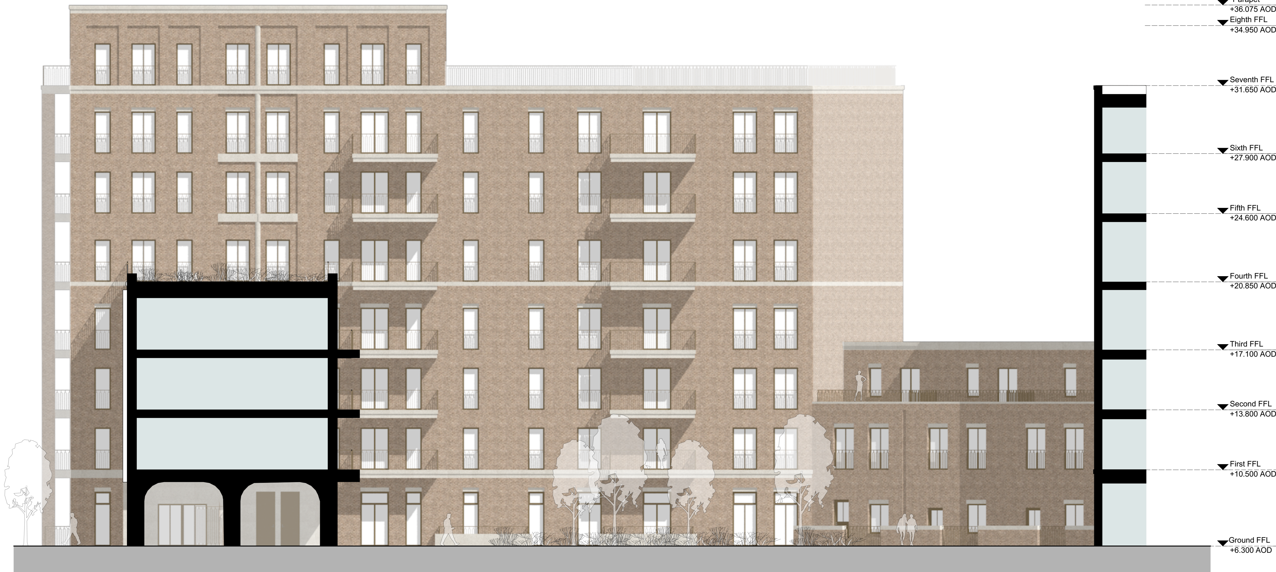
5 Internal Courtyard Elevation - East Scale: 1:100

+44 (0)20 7736 7744 info@assael.co.uk www.assael.co.uk