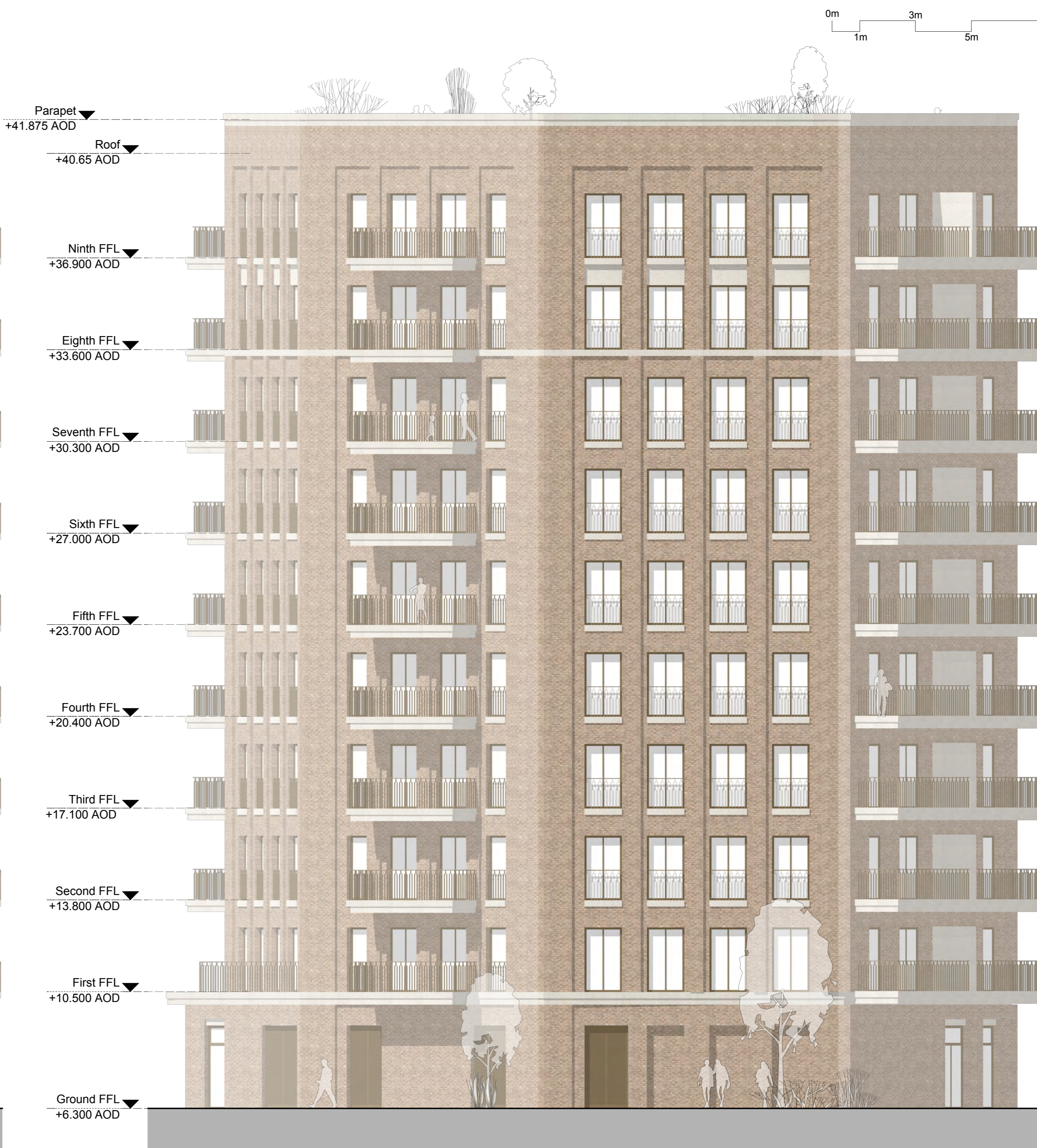
6 Block B West Elevation Scale: 1:100