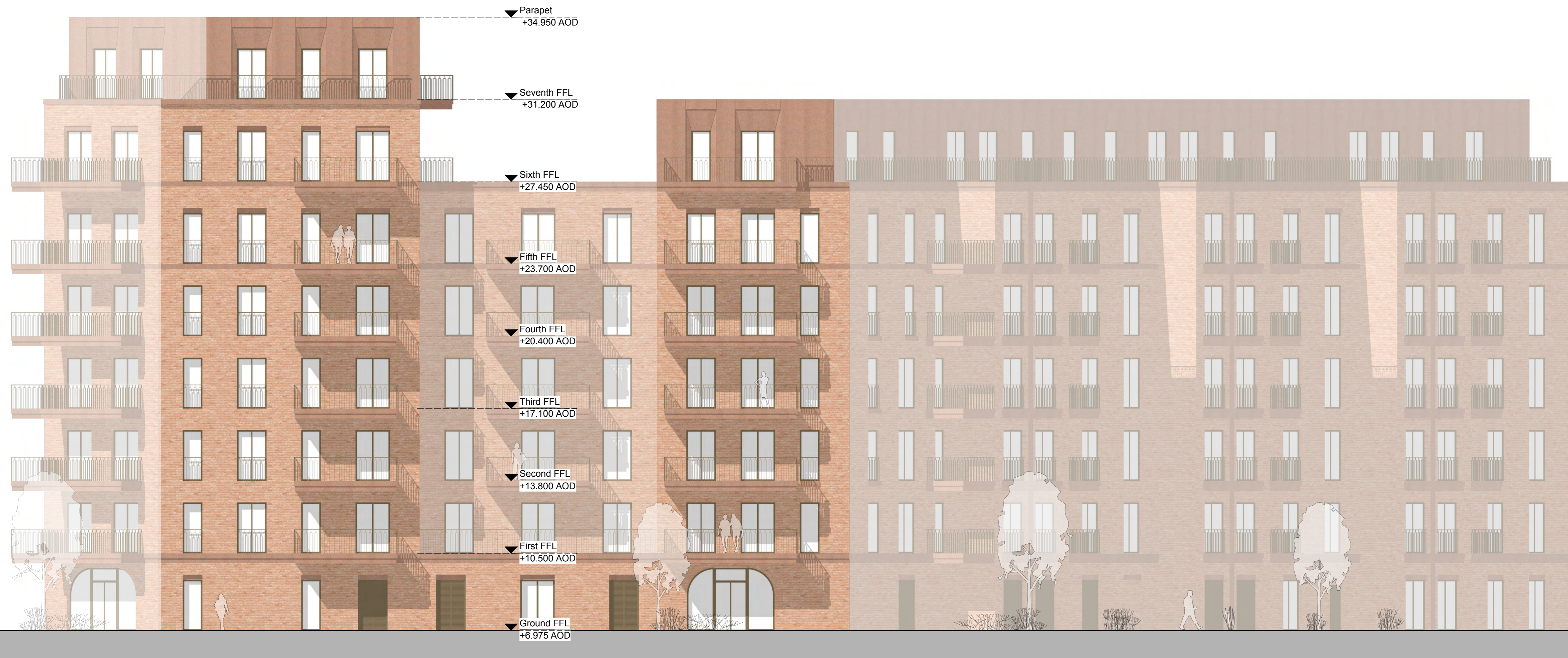
1 Block C North Elevation Scale: 1:100

+44 (0)20 7736 7744 info@assael.co.uk www.assael.co.uk