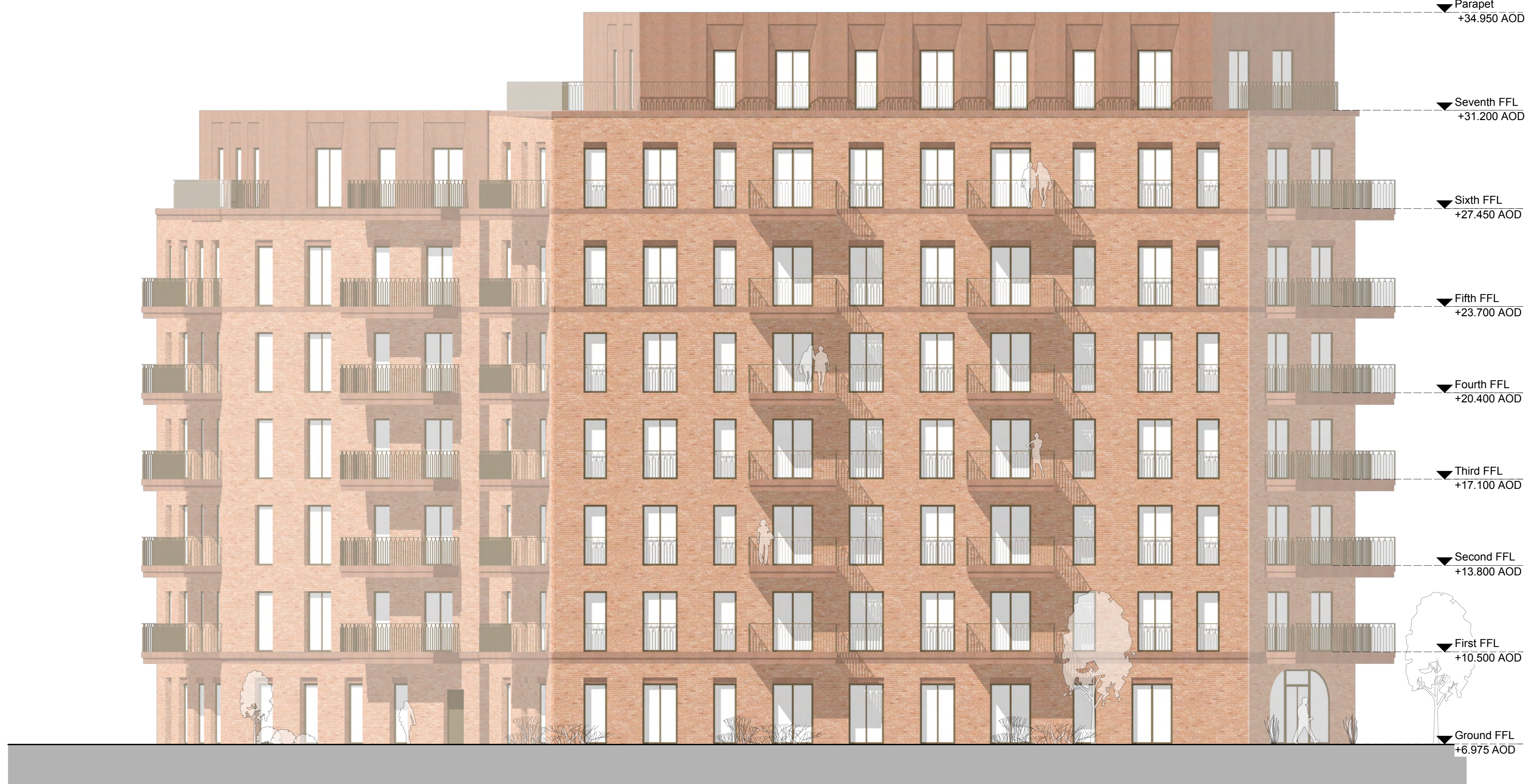
2 Block C East Elevation Scale: 1:100

Assael Architecture Limited 123 Upper Richmond Road London SW15 2TL +44 (0)20 7736 7744 info@assael.co.uk www.assael.co.uk