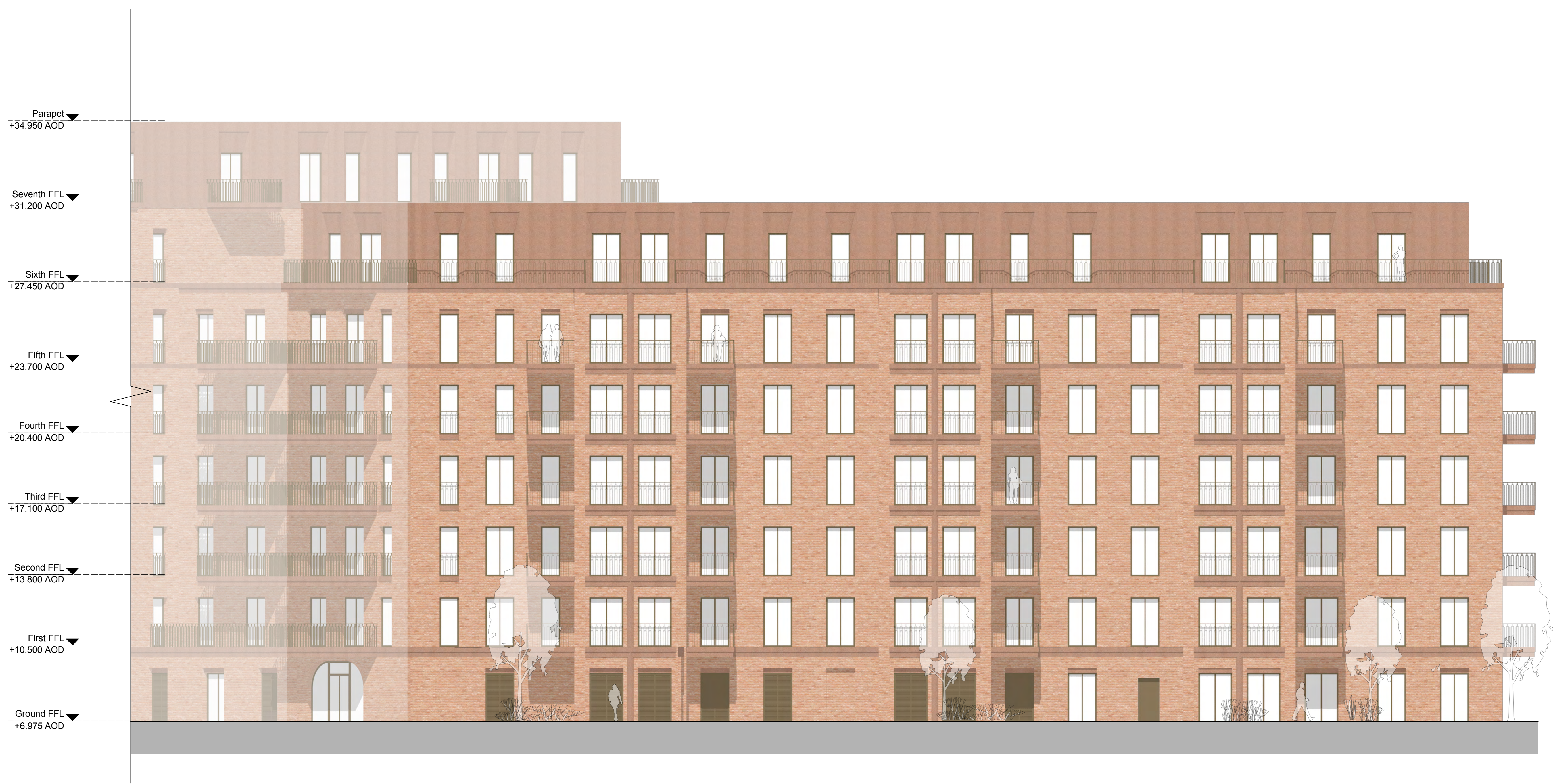
4 Block C West Elevation Scale: 1:100

Electronic file reference MNR-AA-BLC-ZZ-DR-A-4300