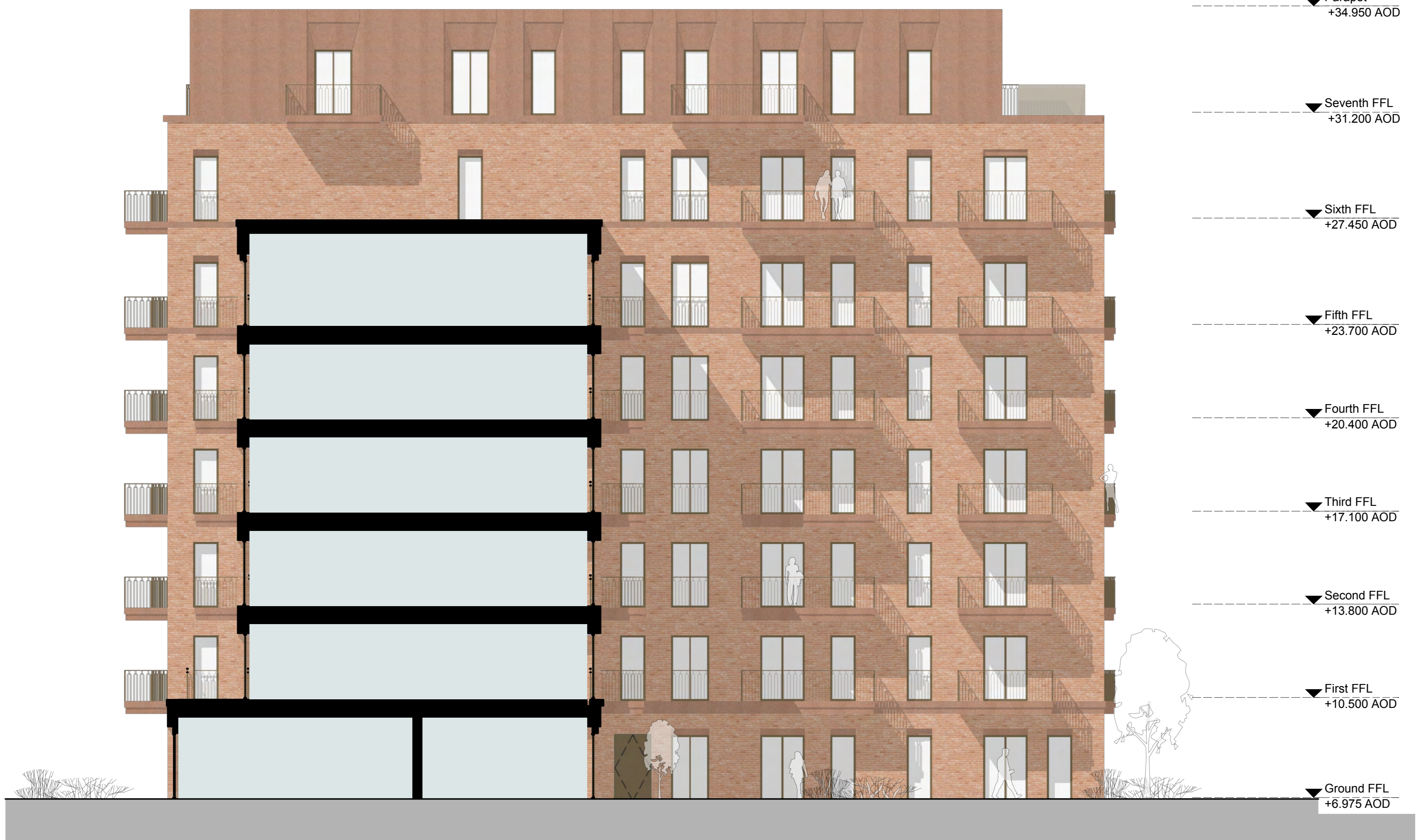
5 Block C Internal Courtyard Elevation Scale: 1:100

Assael Architecture Limited 123 Upper Richmond Road London SW15 2TL +44 (0)20 7736 7744 info@assael.co.uk www.assael.co.uk