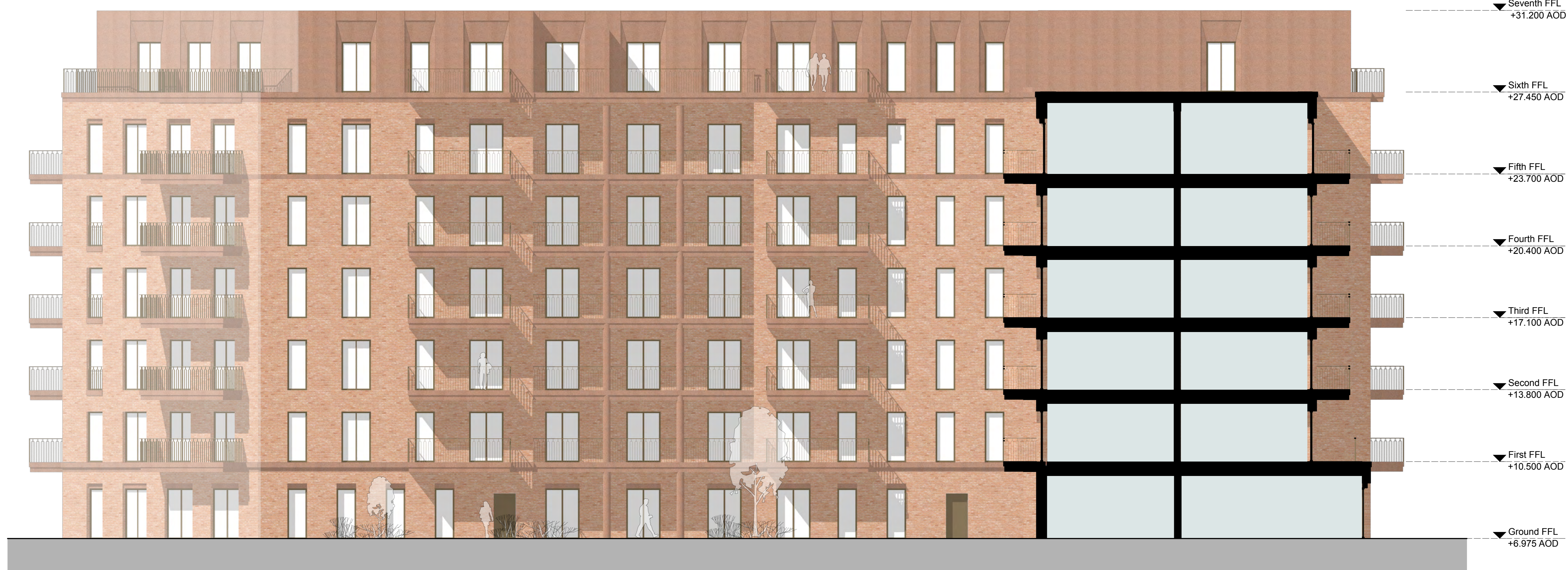
6 Internal Courtyard Elevation Scale: 1:100

Assael Architecture Limited 123 Upper Richmond Road London SW15 2TL +44 (0)20 7736 7744 info@assael.co.uk www.assael.co.uk