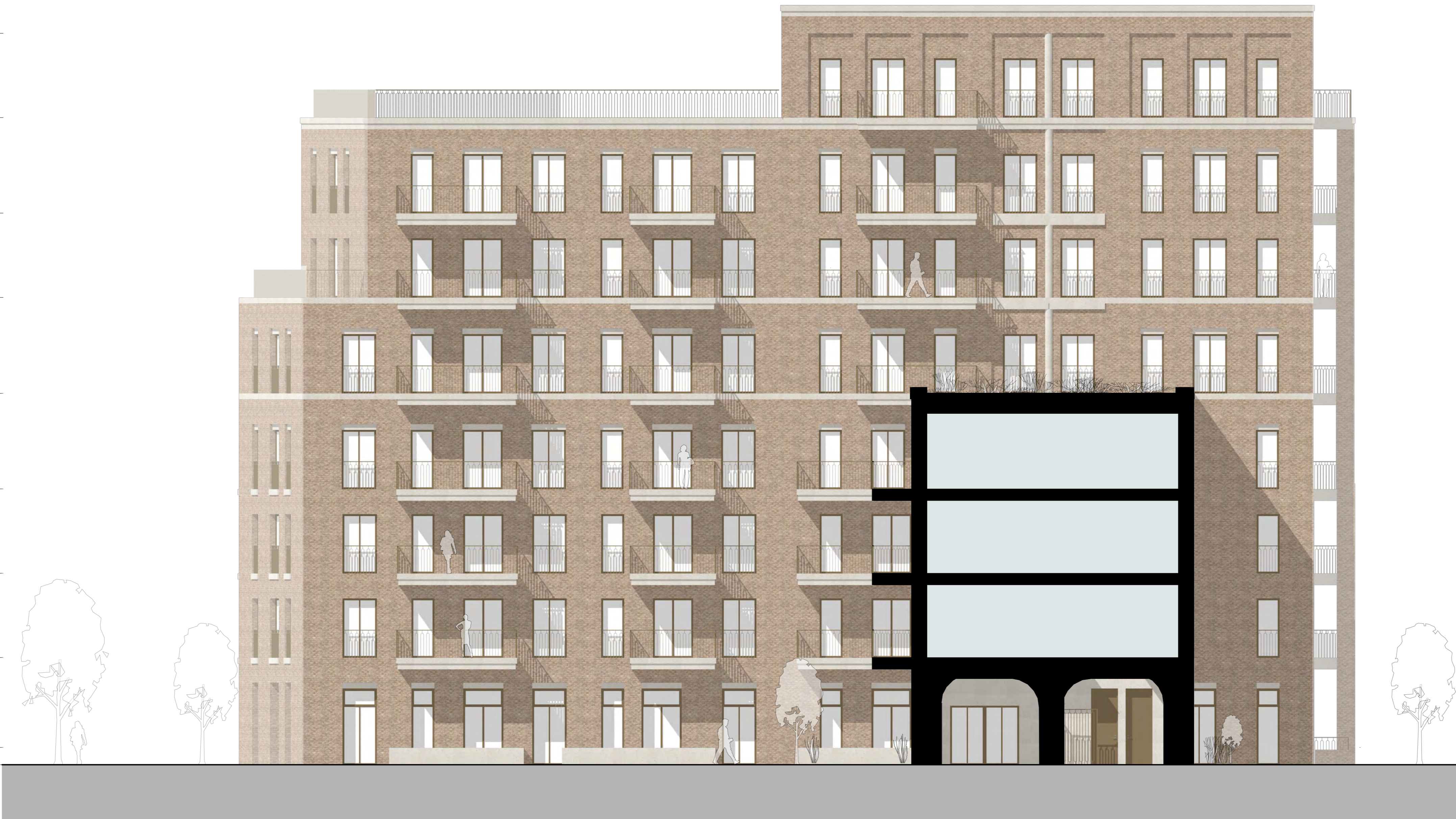
6 Block D East Internal Courtyard Elevation Scale: 1:100

Parapet +39.725 AOD Roof +38.150 AOD Eighth FFL +33.750 AOD Seventh FFL +30.750 AOD Sixth FFL +27.000 AOD Fifth FFL +23.700 AOD Fourth FFL +20.400 AOD Third FFL +17.100 AOD Second FFL +13.800 AOD First FFL +10.500 AOD Ground FFL +6.975 AOD Commercial FFL +6.300 AOD