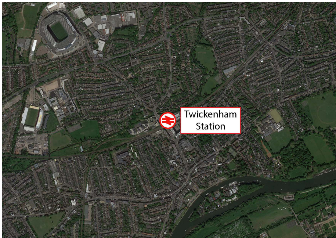
Figure 1.1: Site Location