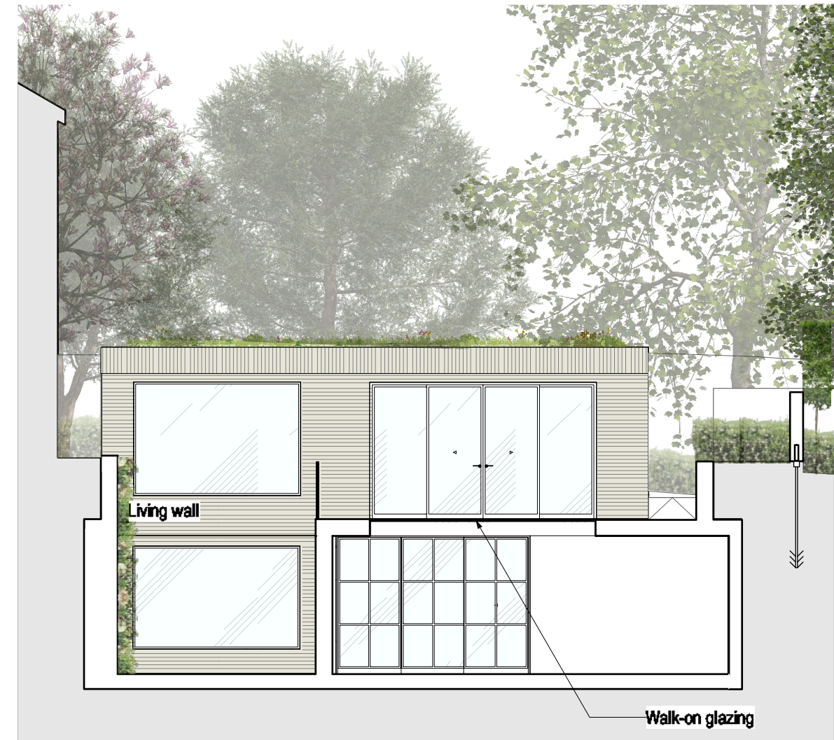
Proposed section E:E looking SW