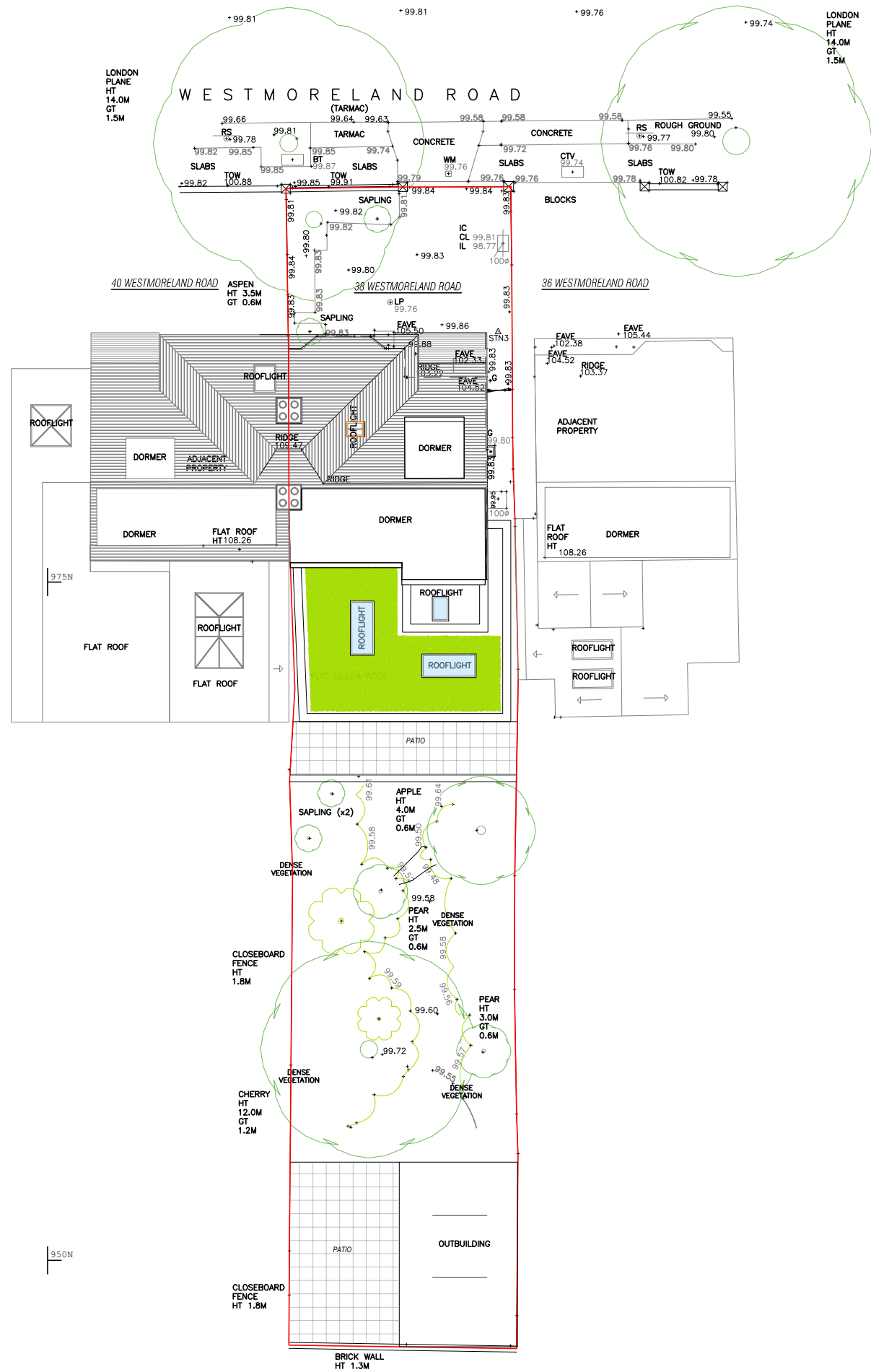
1 | SITE AND ROOF PLAN AS BUILT GA-S&R-P SCALE: 1:200 @ A3 // 1:100 @ A1

DISCLAIMER: Dimensions to be verified on site. Only figured dimensions to be used and any discrepancies in dimensions are to be reported to R.J.H.A. No dimensions are to be scaled from printed drawings. Any areas indicated on this drawing are for guidance only. No responsibility is taken for their accuracy. There is a risk of injury or death in construction if works are not properly planned and supervised. The contractor must not undertake any elements of the work without first having carried out the necessary risk assessments and prepare detailed method statements.