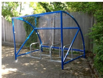
DETAIL OF COVERED CYCLE ENCLOSURE Bikedock Solutions 2100 x 2100 x 2100 high cycle enclosure with galvanised bike stands for 6 cycles.

One unit provided for 2 x 240L refuse bins and one unit for 1 x 360L mixed recycling, 1 x 360L paper/cardboard recycling as above.