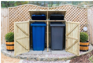
DETAIL OF REFUSE/RECYCLING STORE WheelieBin Warehouse double refuse bin/recycling timber storage unit, 1450 x 970 x 1270 high.

One unit provided for 2 x 240L refuse bins and one unit for 1 x 360L mixed recycling, 1 x 360L paper/cardboard recycling as above.