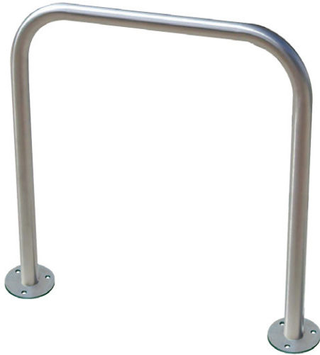
DETAIL OF SHEFFIELD CYCLE STAND Workplace Depot 755 long x 30mm dia. galvanised steel 2 cycle stand.