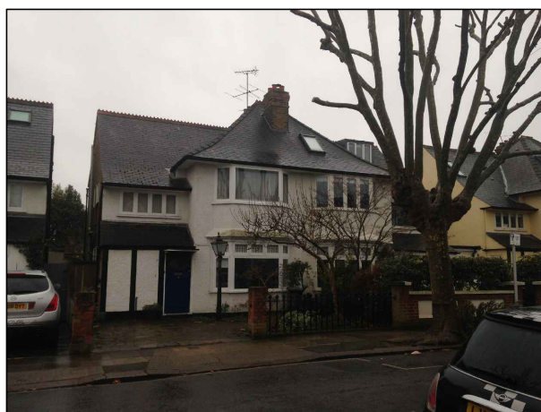
1 FRONT ELEVATION PHOTOGRAPH