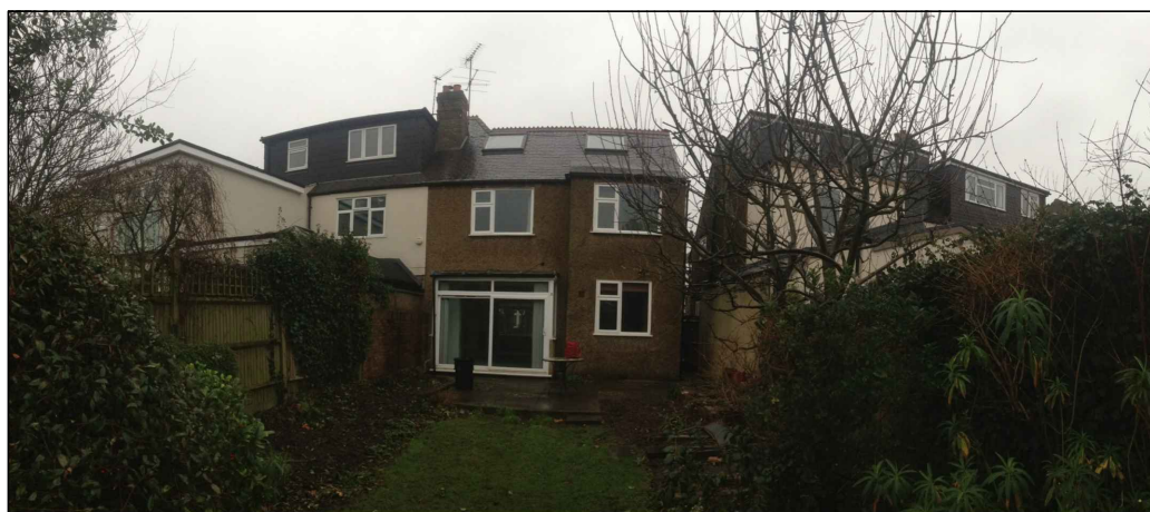
1 REAR ELEVATION PHOTOGRAPH