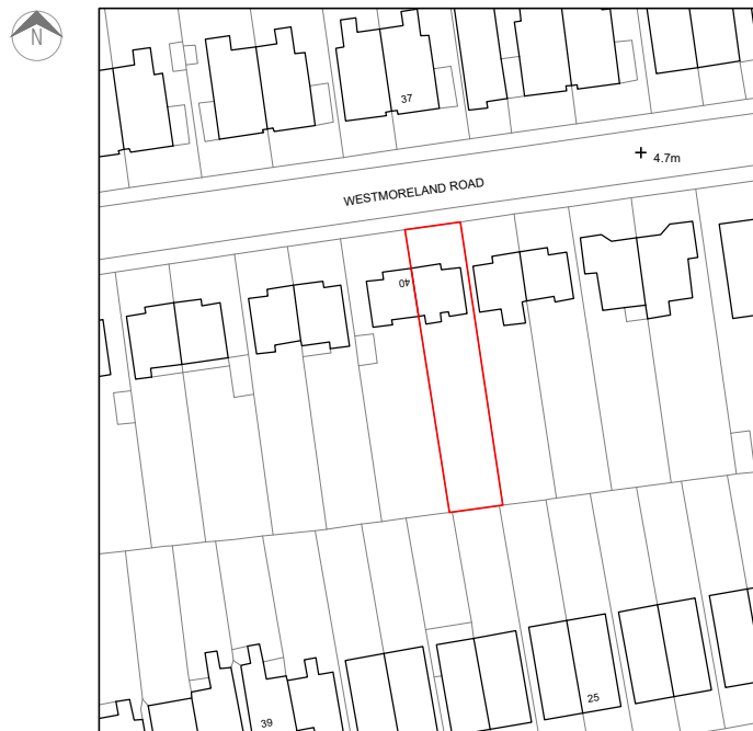
1 LOCATION PLAN AS PRE-EXISTING