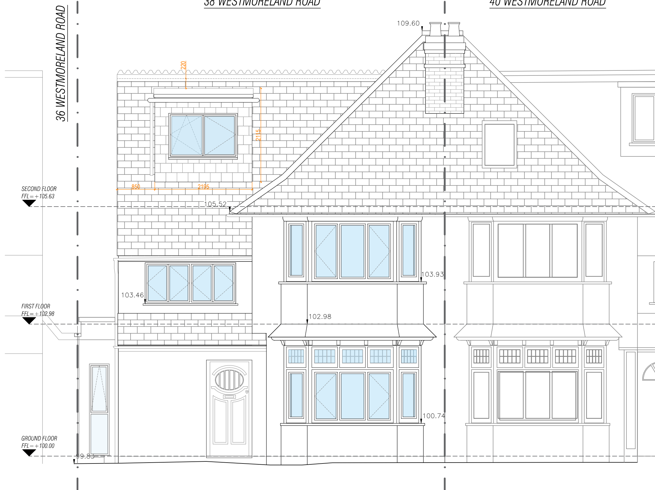
1 FRONT ELEVATION AS EXISTING GA-E-A SCALE: 1:50 @ A3 // 1:25 @ A1