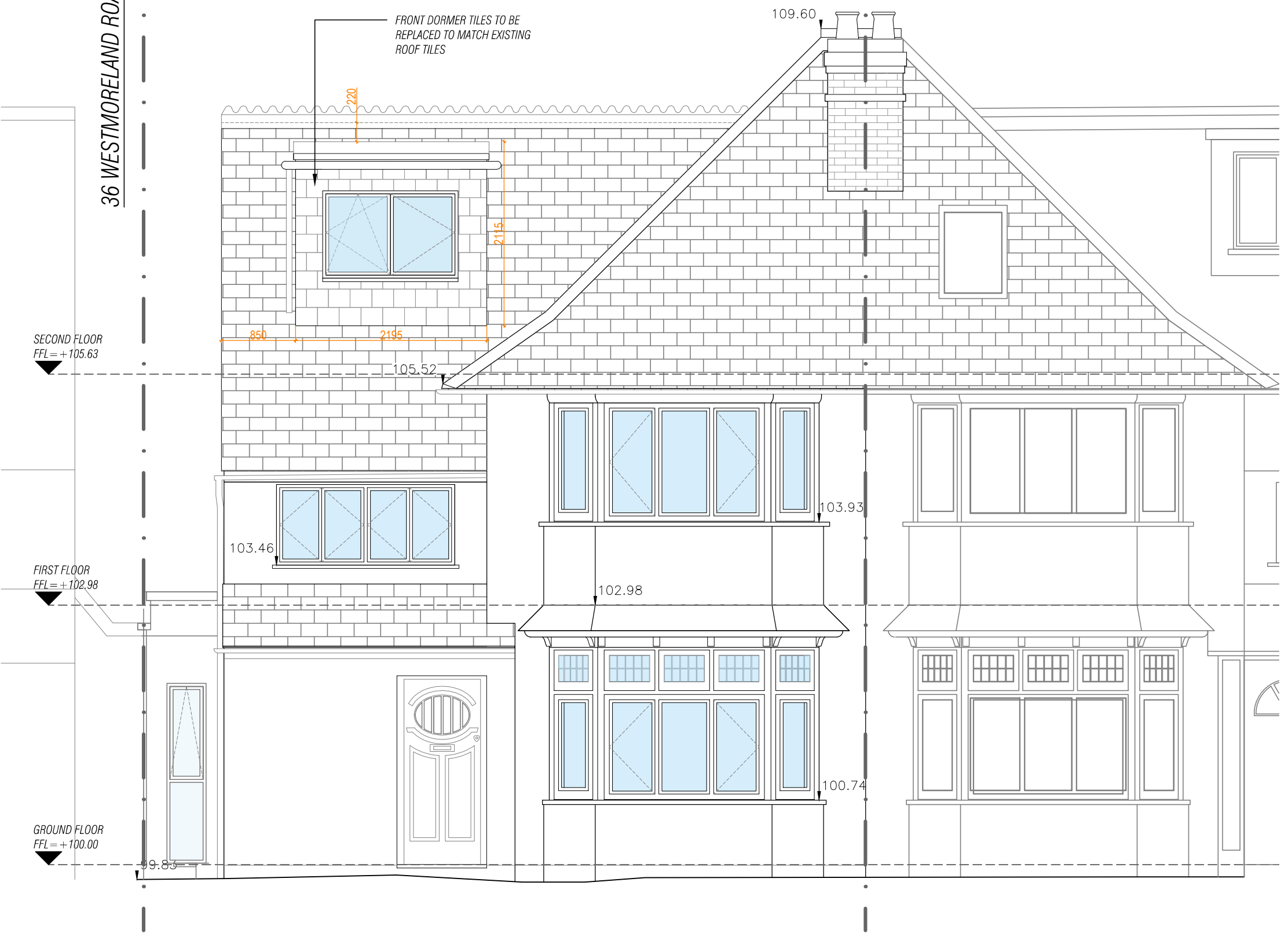
1 FRONT ELEVATION AS PROPOSED GA-E-A SCALE: 1:50 @ A3 // 1:25 @ A1