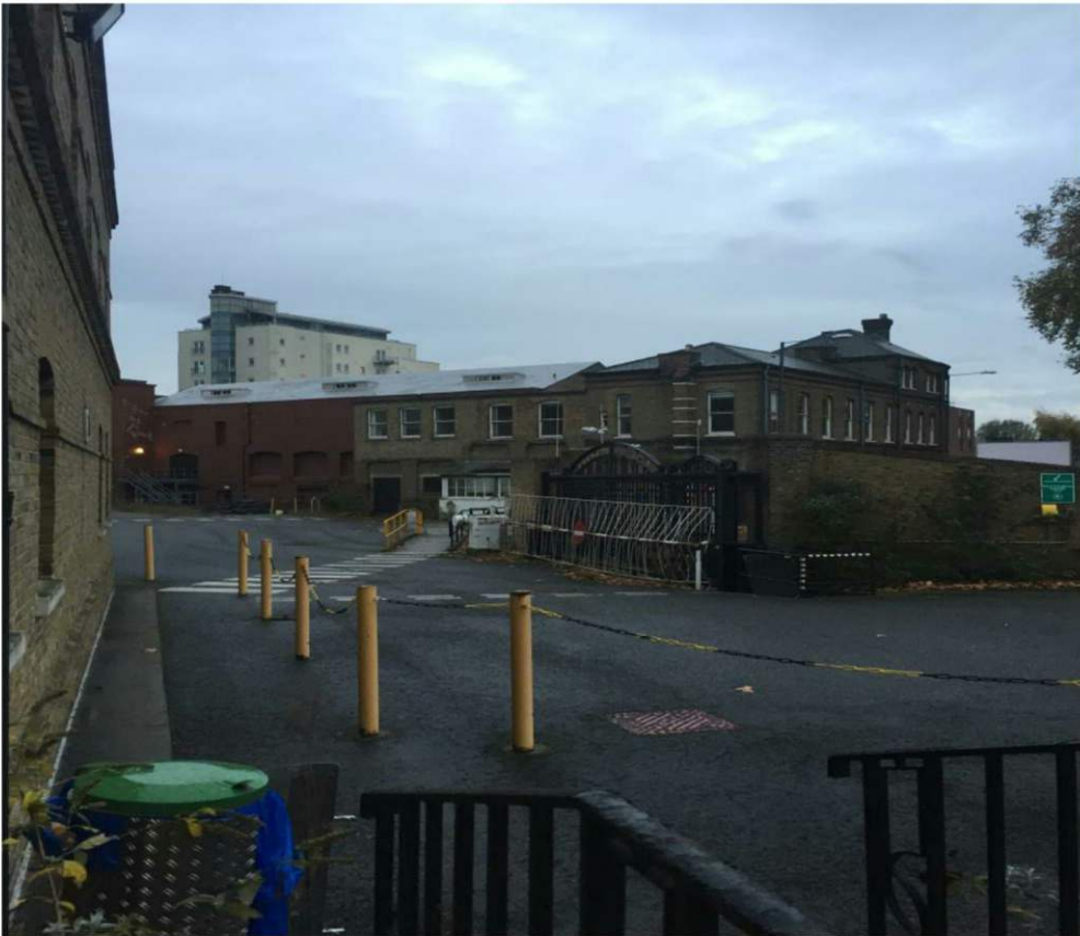
Figure 24 - View towards Mortlake High Street from Development area 1