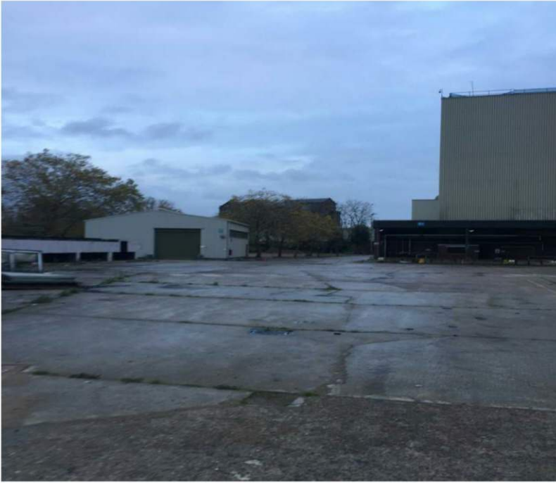
Figure 27 - View towards the Maltings Building from Development area 2