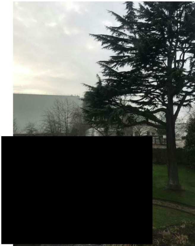
Figure 20 - View south from second floor window