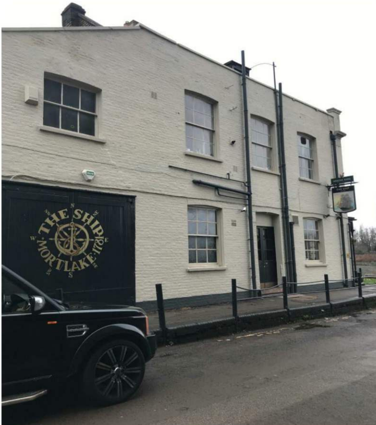
Figure 34 – The Ship viewed from Ship Lane