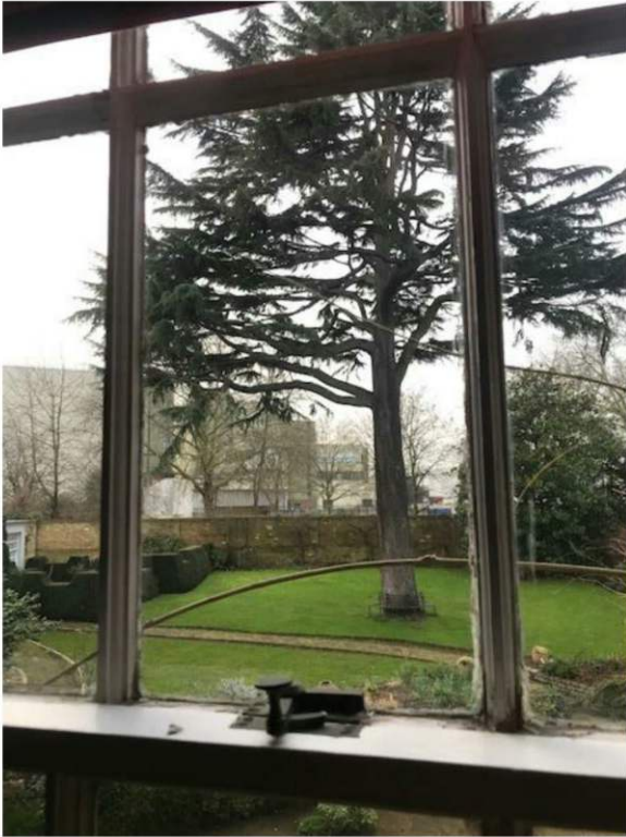
Figure 19 - Looking south from first floor hallway window