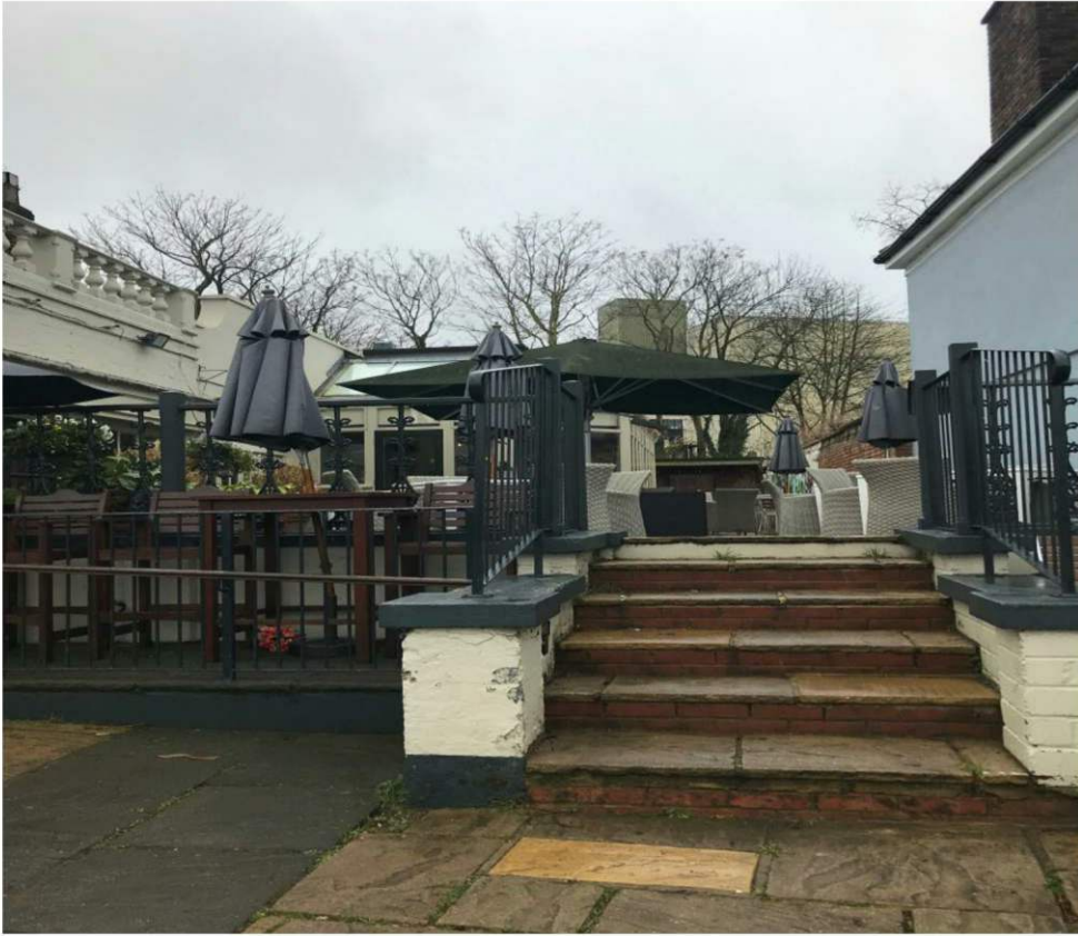
Figure 33 - View from The Ship towards Development Area 2