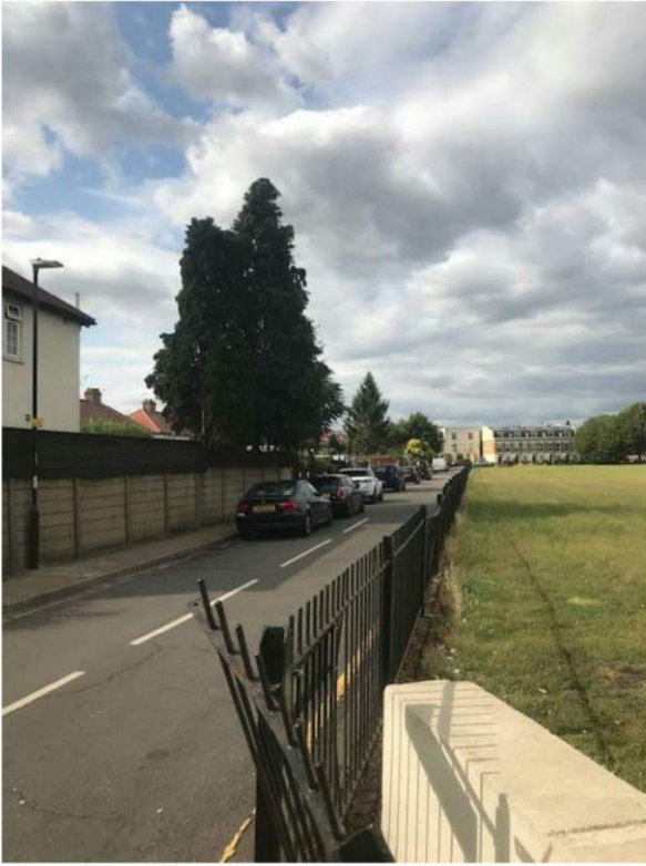
Figure 3 - Williams Lane (looking North)