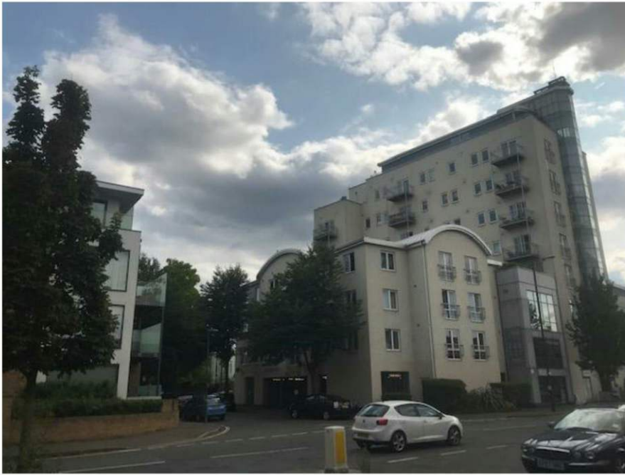
Figure 1 - Mortlake High Street / Vineyard Path