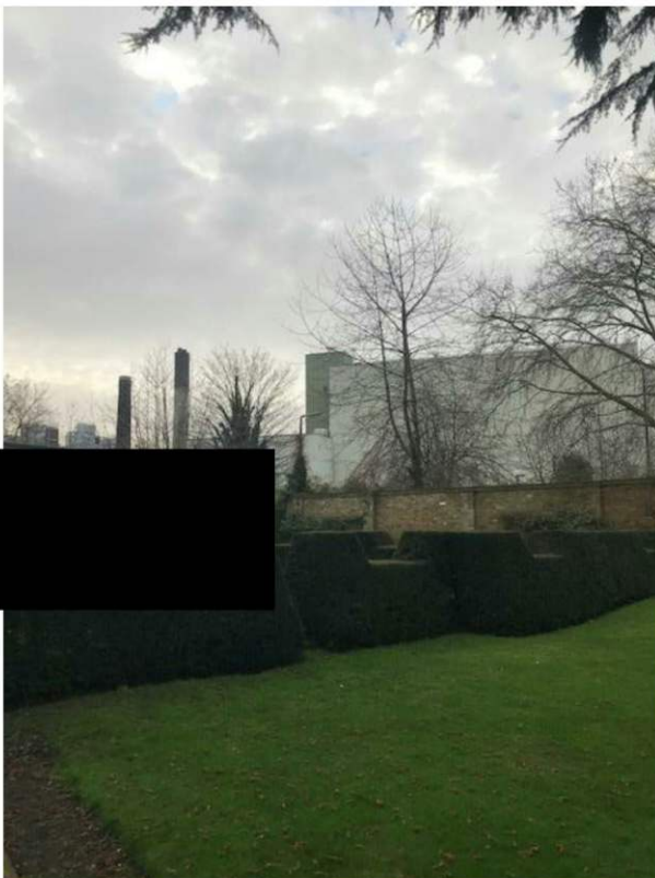
Figure 18 - looking south east towards Development Area 1