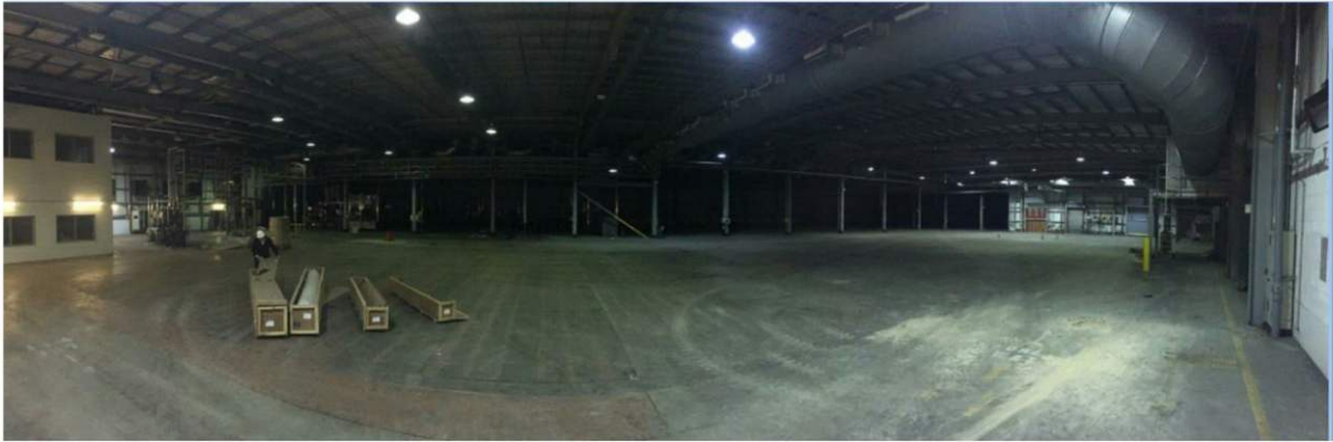
Figure 31 - View from within the Bottling Plant