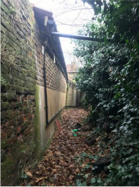
Figure 16 - View looking West from public footpath (towards Aynescombe Cottage)