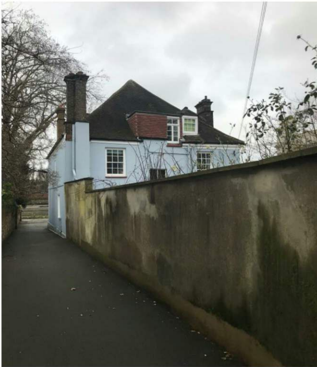
Figure 32 - View of 1 Thames Bank Cottage facing the River Thames