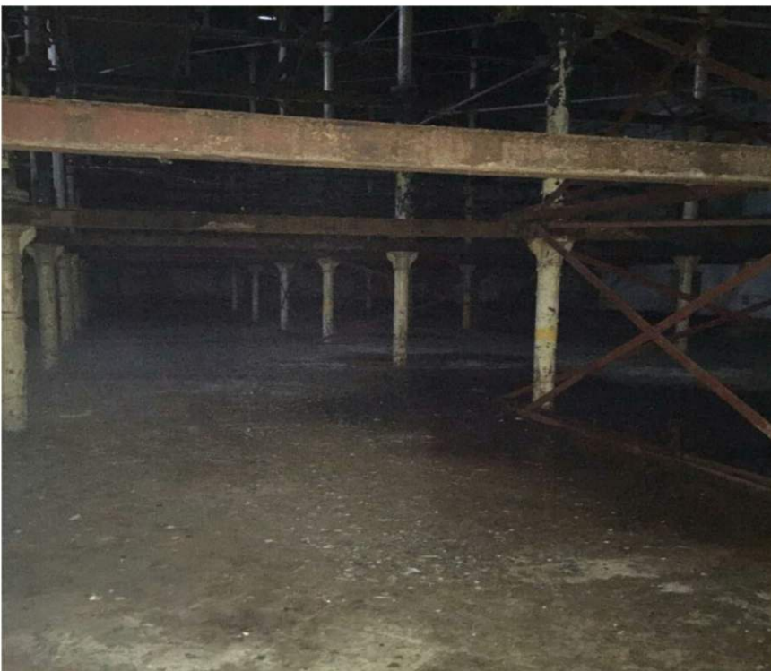
Figure 30 - View from within the Maltings Building