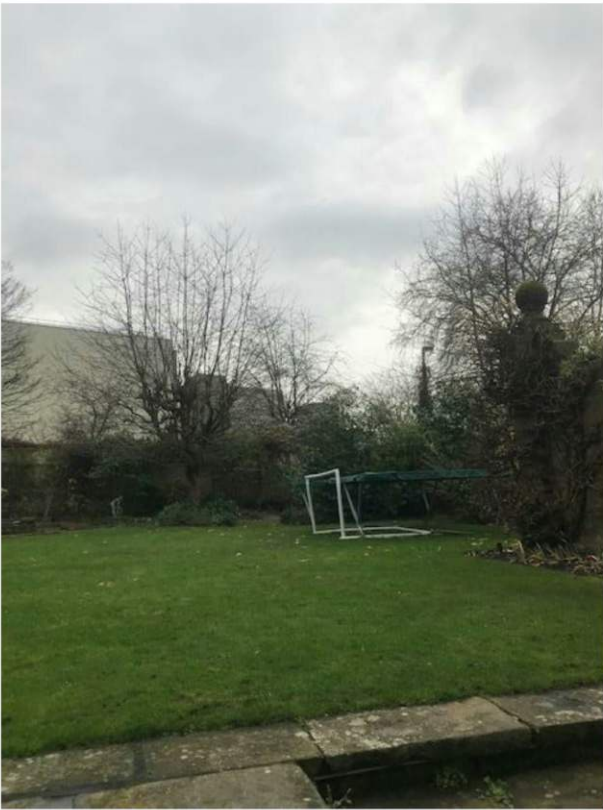
Figure 14 - View from rear garden looking south west towards Development Area 2