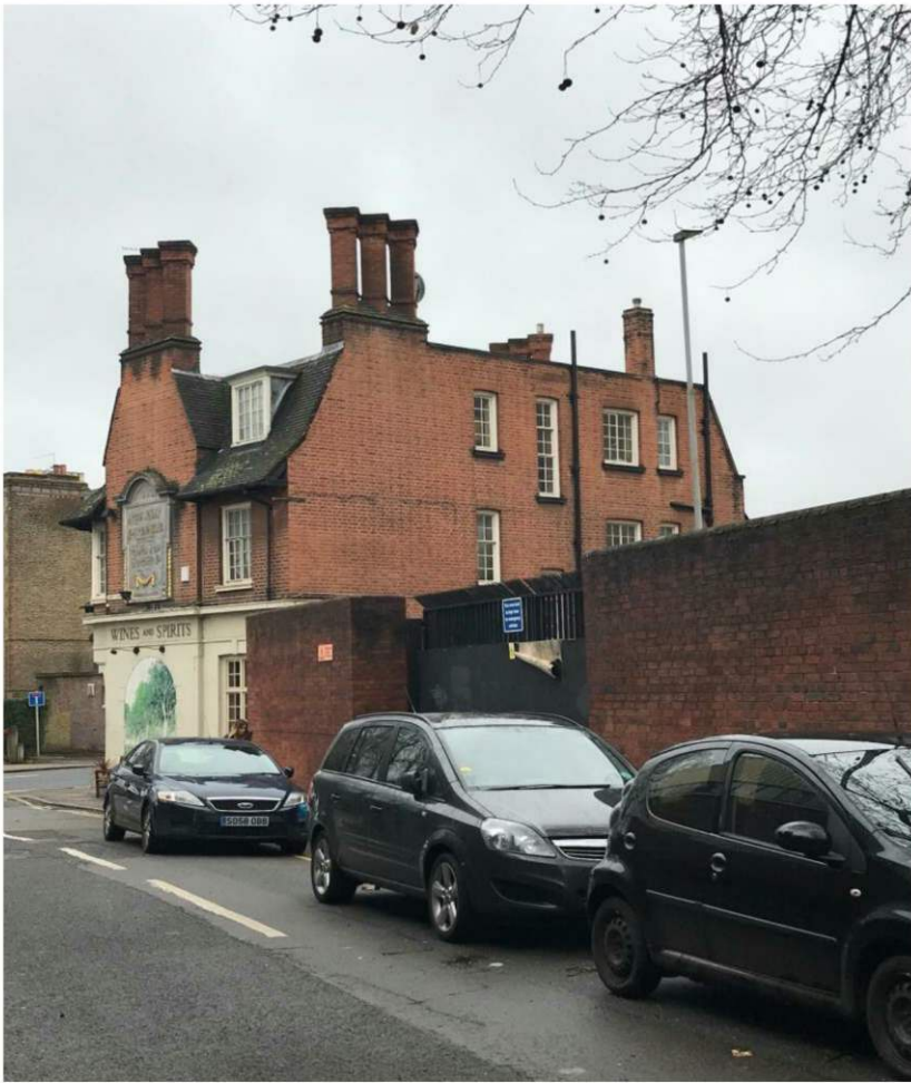
Figure 36 - View of Jolly Gardeners from Ship Lane