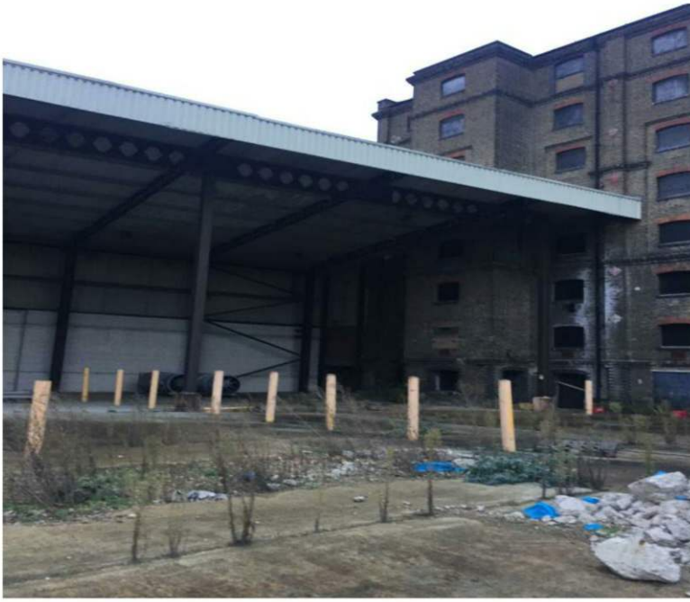
Figure 25 – view towards the back of the Maltings Building