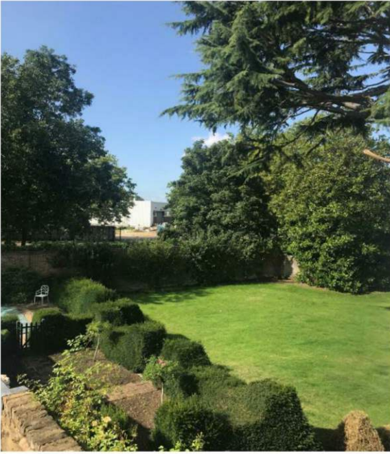
Figure 23 - View towards block 20 from Old Stables