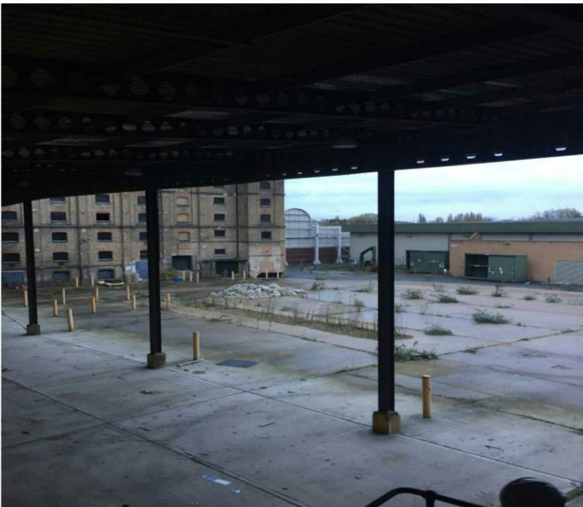
Figure 26 – Additional view towards the back of the Maltings Building