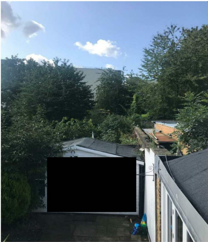
Figure 21 – view towards Stag Brewery from first floor of Old Stables