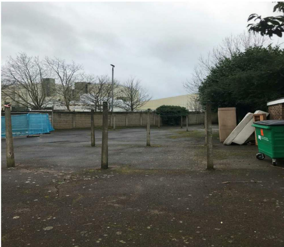
Figure 28 - View from Development Area 2