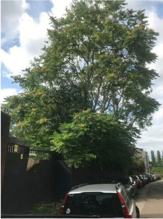
Figure 9 - View North from Ship Lane towards Ship Inn