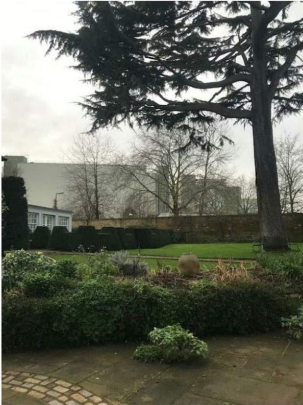
Figure 17 - Looking south towards Block 20 of Development Area 2