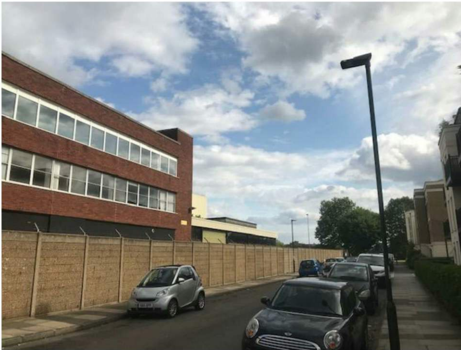
Figure 5 - Williams Lane looking south across Development Area 2