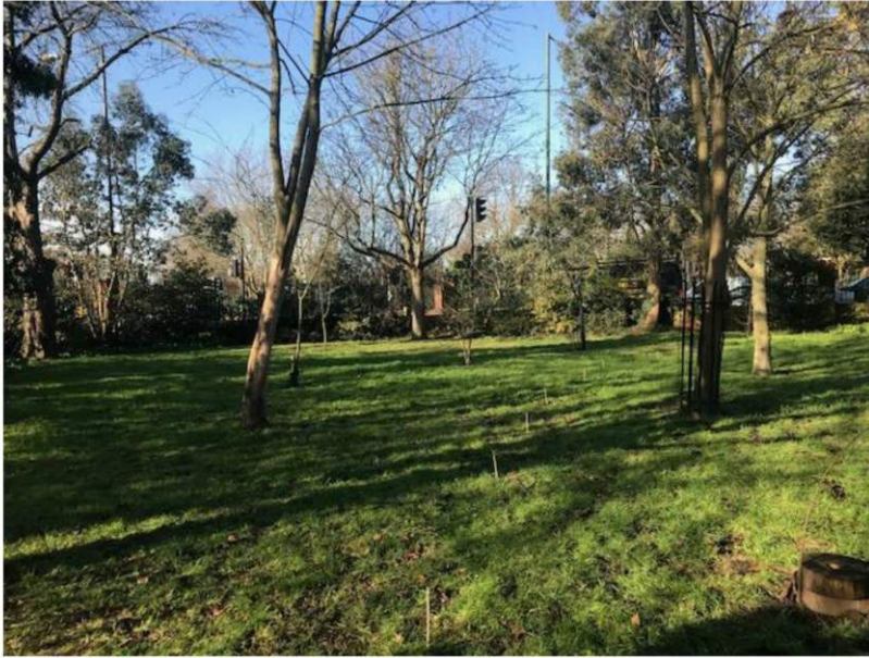
Figure 38 – View from Chalkers Corner facing Clifford Avenue