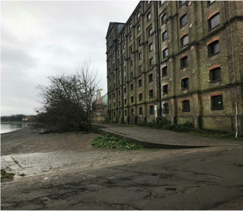
Figure 35 - View of the Maltings Building from the Thames Bank