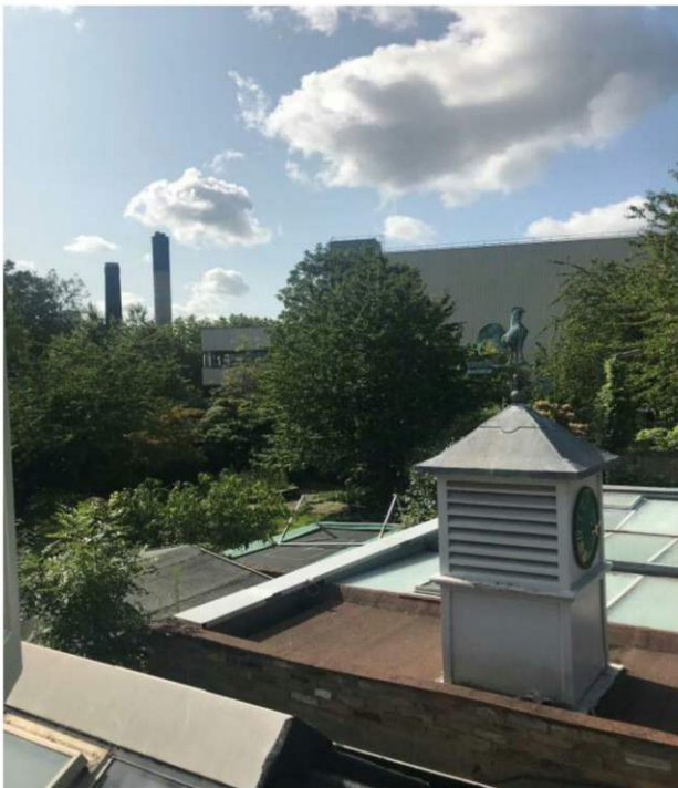
Figure 22 - View towards Block 21 from Old Stables