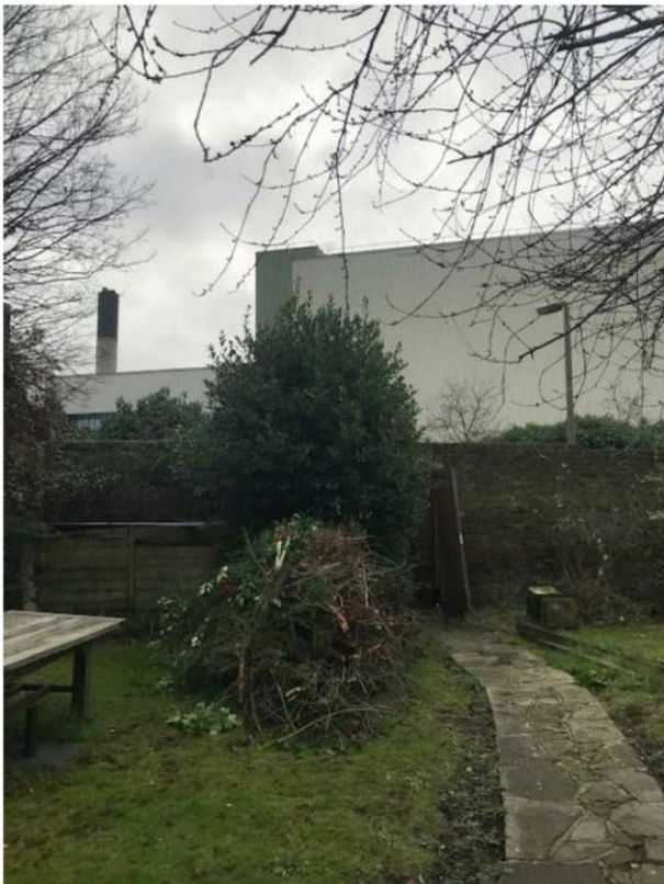
Figure 13 - View from rear garden looking south east towards Development Area 1 / 2