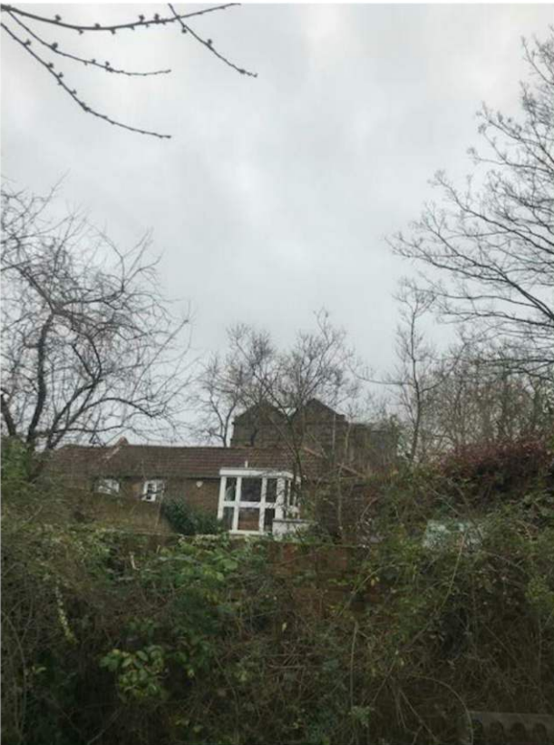
Figure 15 - View looking east towards Aynescombe Cottage / Maltings Building