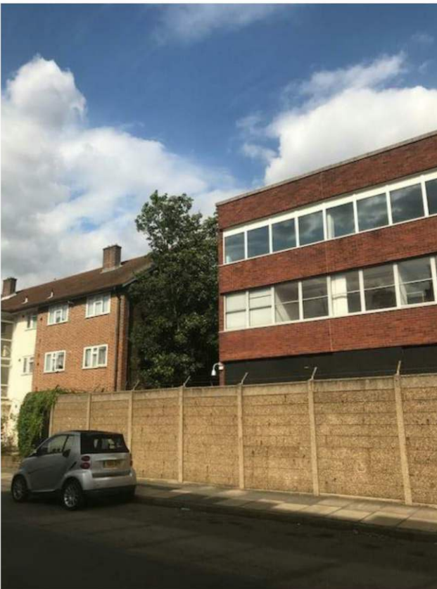
Figure 4 - Williams Lane - boundary of Development Area 2