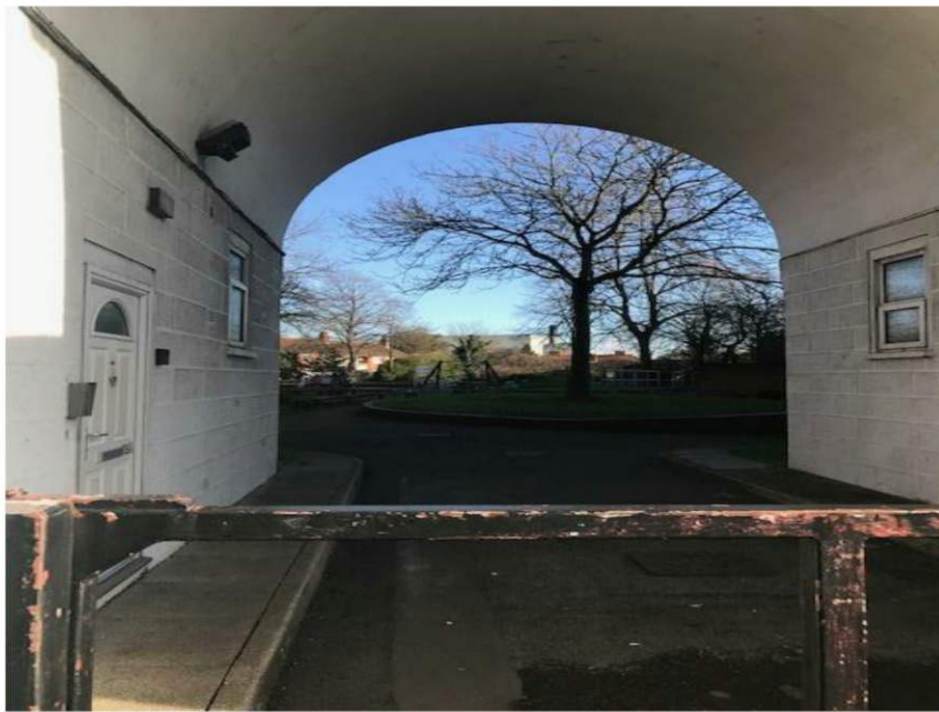
Figure 39 – View of Chertsey Court from Chalkers Corner