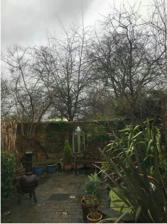
Figure 10 - View from outdoor living area towards Stag Brewery (Block 20)