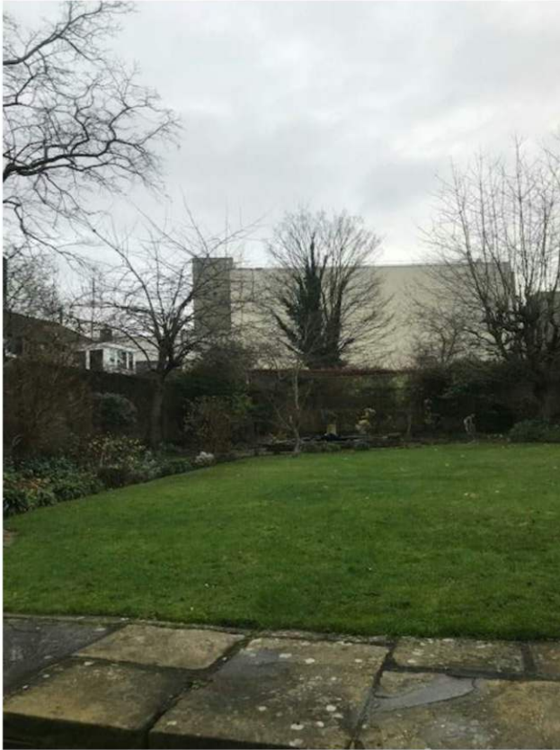
Figure 12 - View from rear garden looking south towards Development Area 2