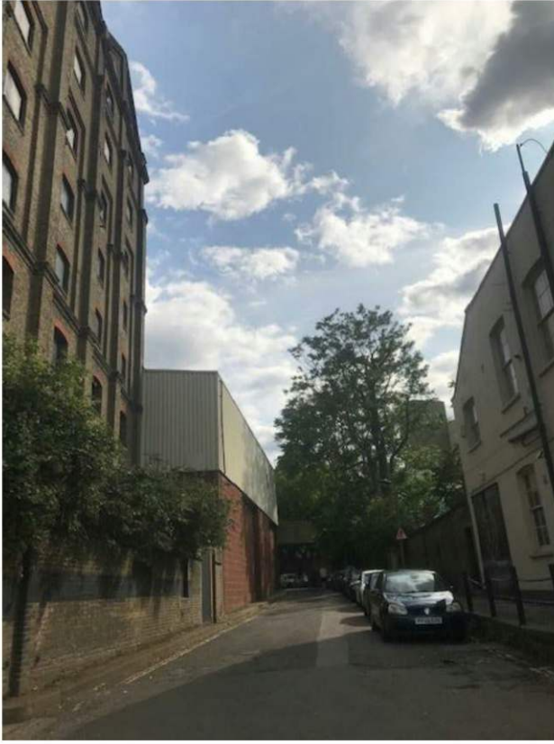
Figure 7 - View south along Ship Lane