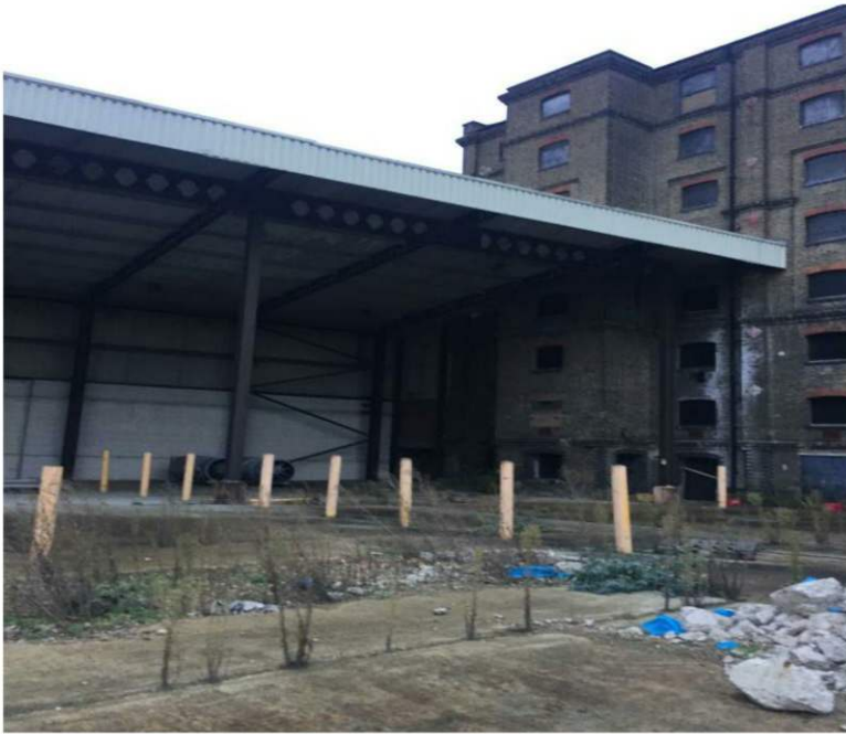
Figure 25 – view towards the back of the Maltings Building