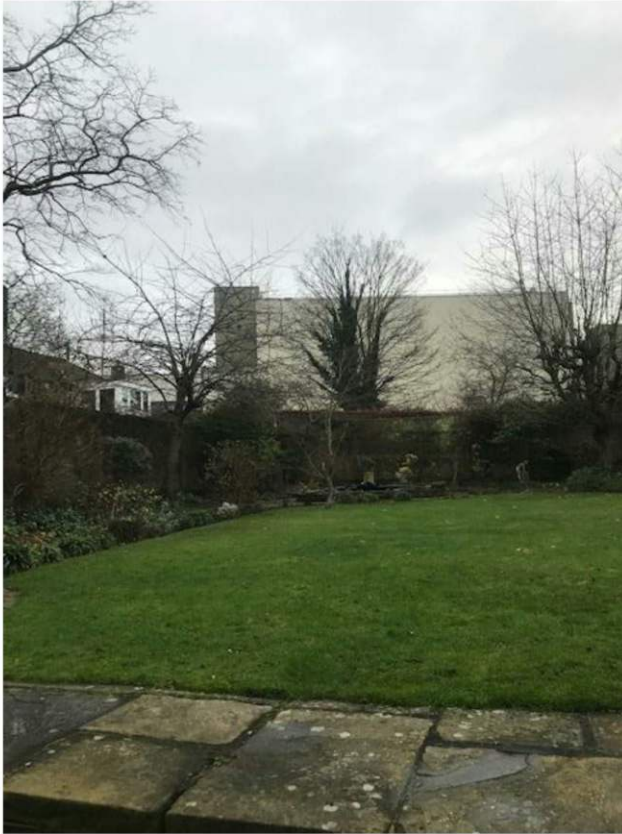
Figure 12 - View from rear garden looking south towards Development Area 2