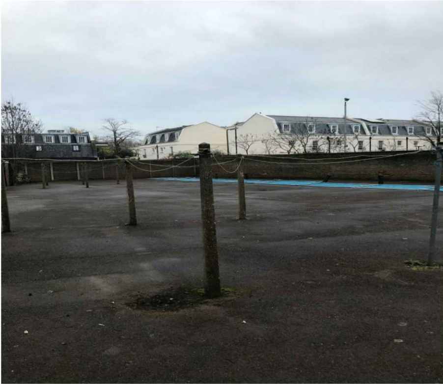
Figure 29 - View towards Parliament Mews from Development Area 2 (Block 20)