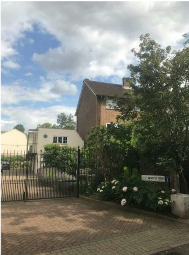
Figure 6 - Varsity Row - Looking South East towards Block 20/21 of Development Area 2 / Development Area 1