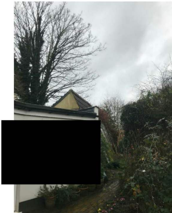
Figure 11 - View towards Stag Brewery (Block 21)