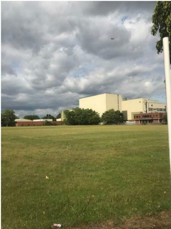
Figure 2 - Playing fields looking north east