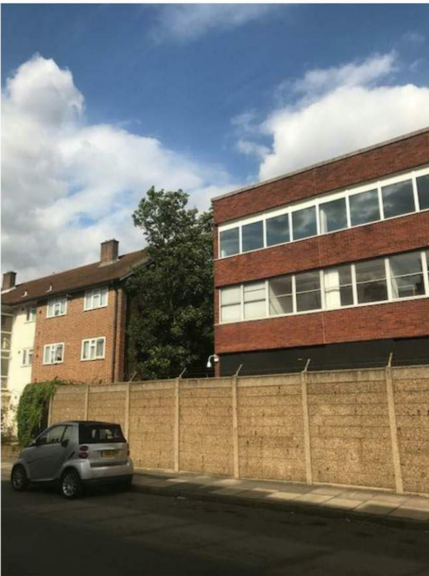
Figure 4 - Williams Lane - boundary of Development Area 2