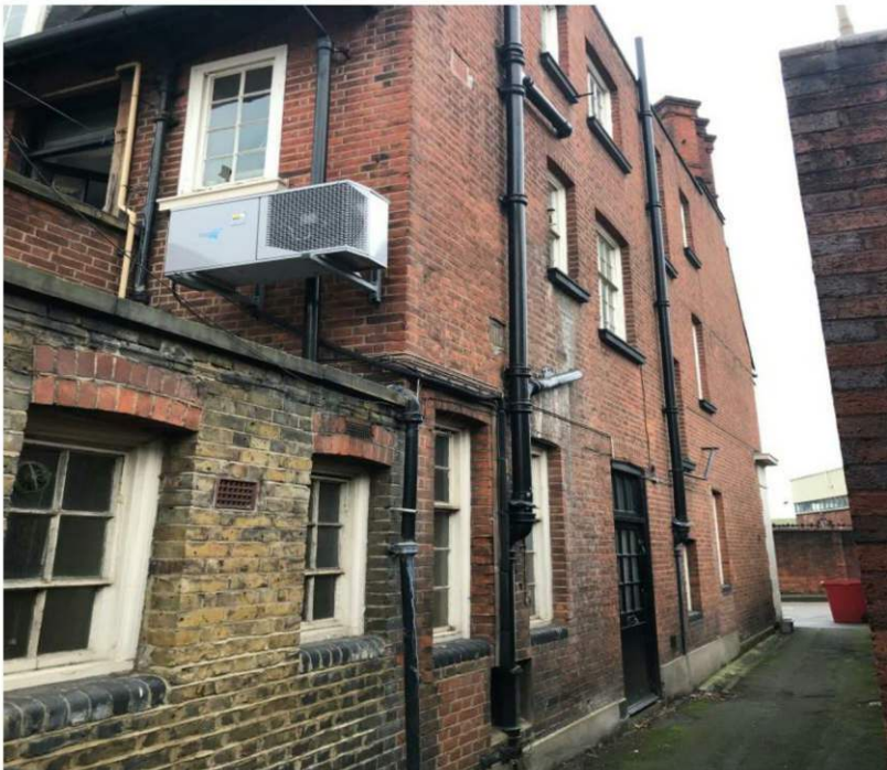
Figure 37 - View of Jolly Gardeners from laneway