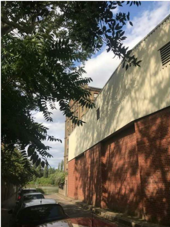
Figure 8 - View North from Ship Lane