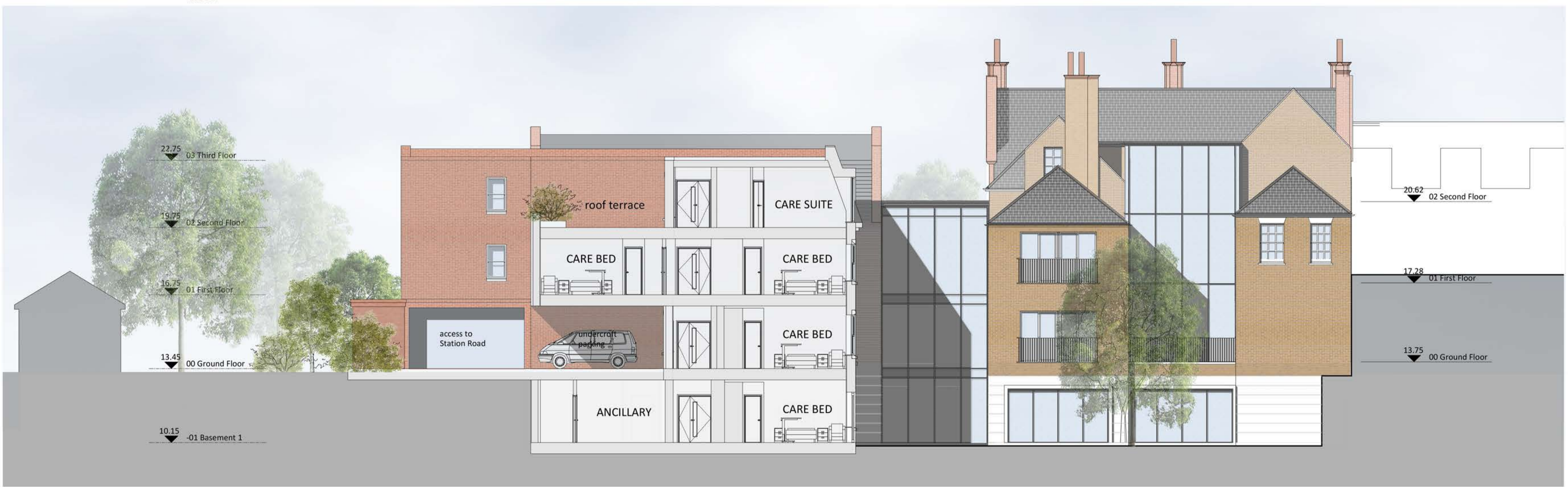
Section A-A - North Elevation through Courtyard Garden 1:100