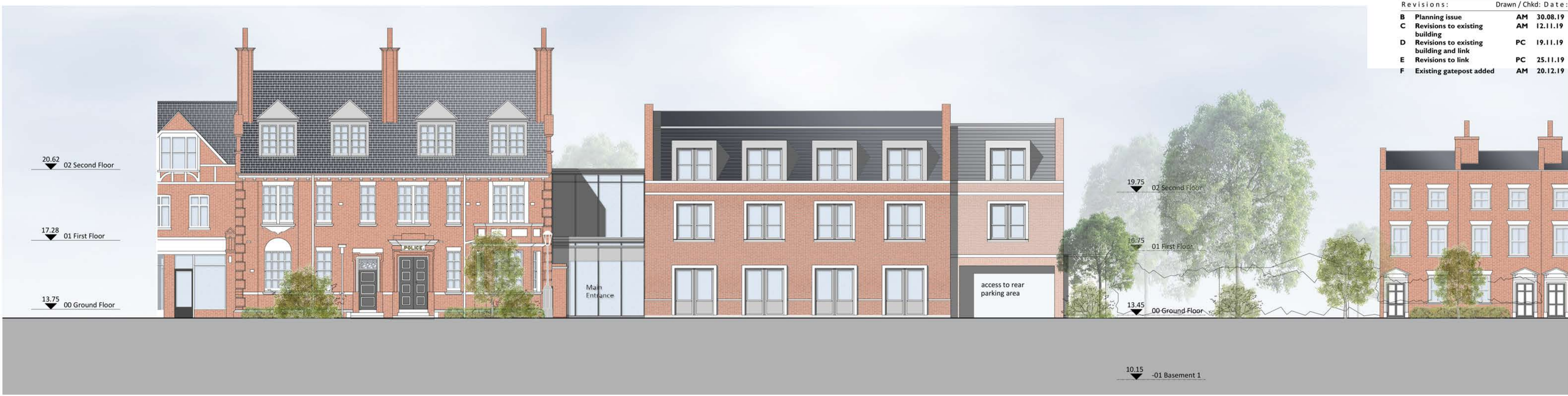
Station Road Elevation - South Elevation 1:100