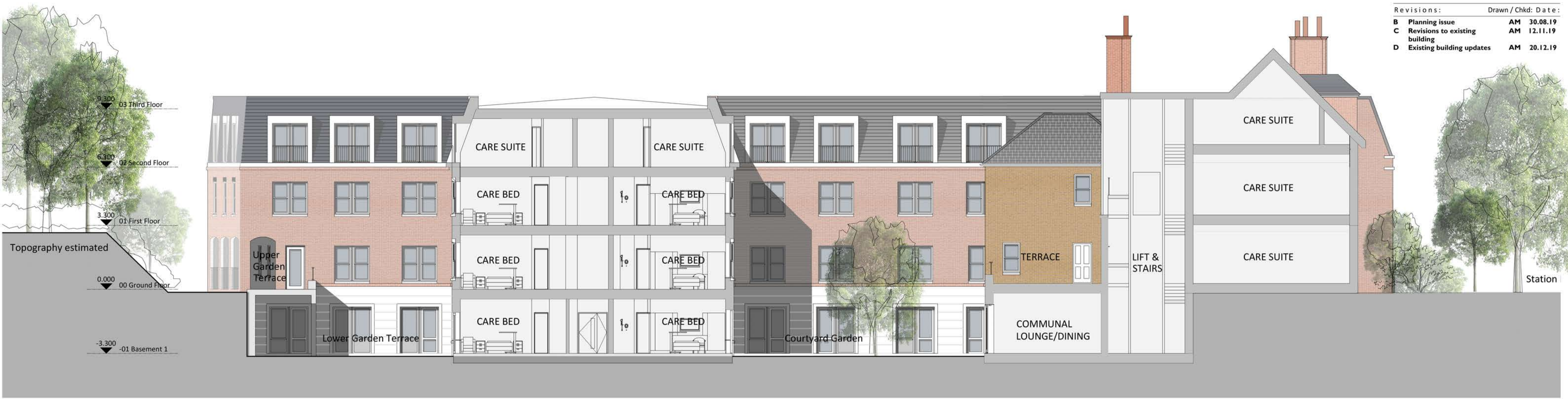
Section B-B - West Elevation / Site Cross Section I:100