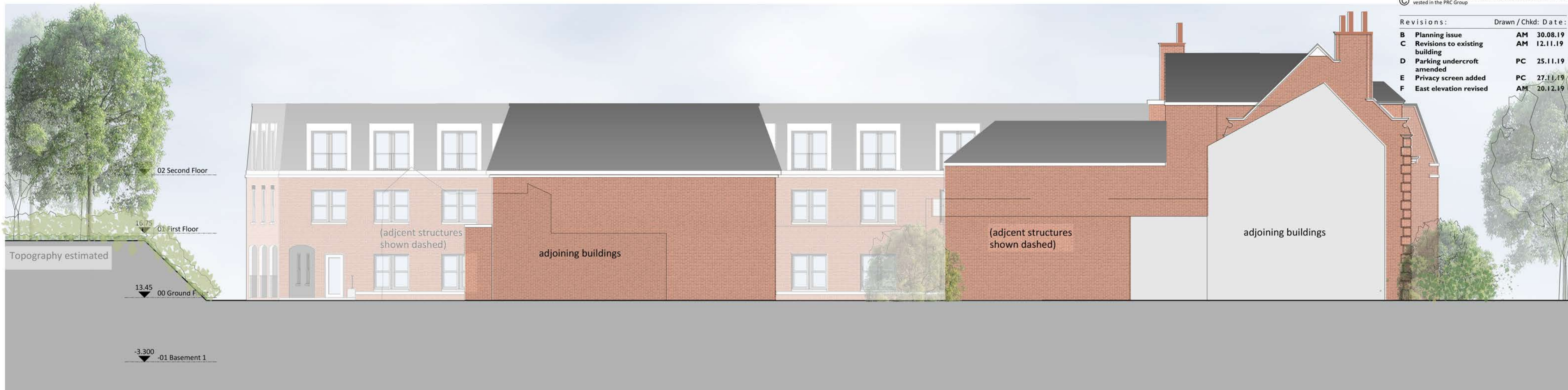
Elevation E - West Elevation 1:100