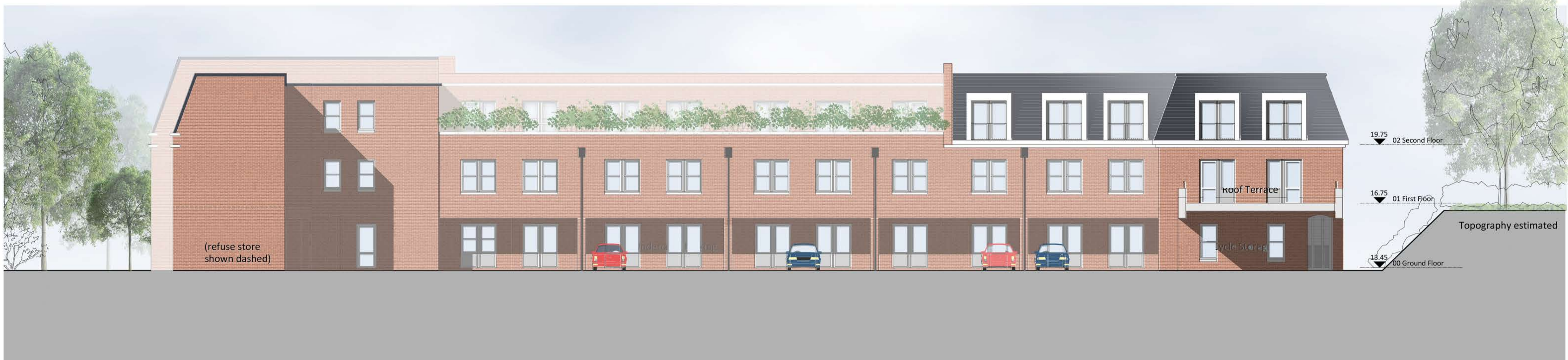
Elevation F - East Elevation 1:100