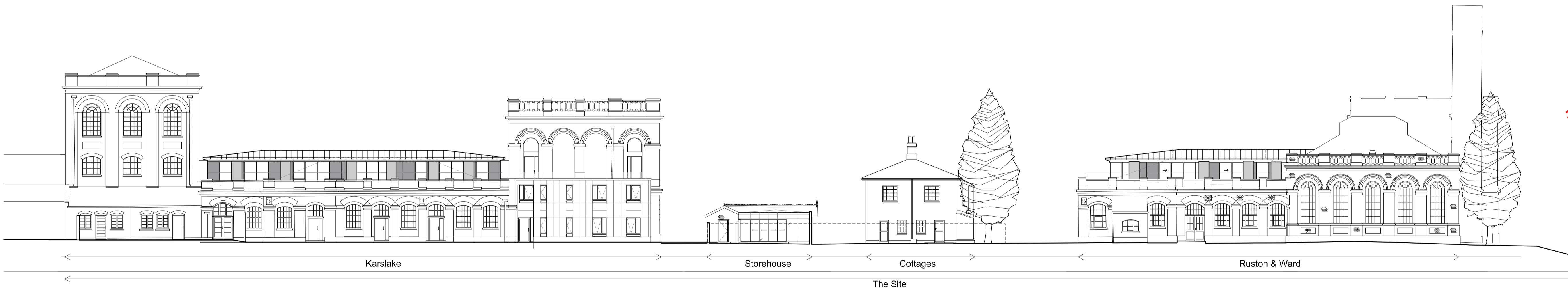
SCALE 1:200 Site elevation - South, Water