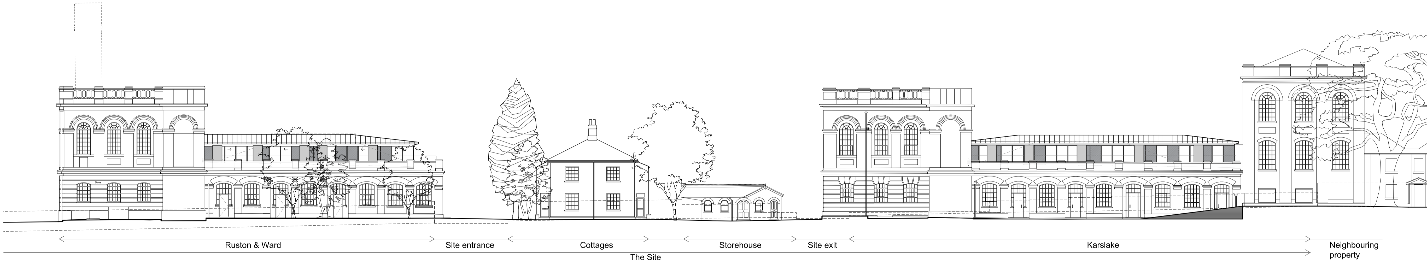
SCALE 1:200 Site elevation - North, Street