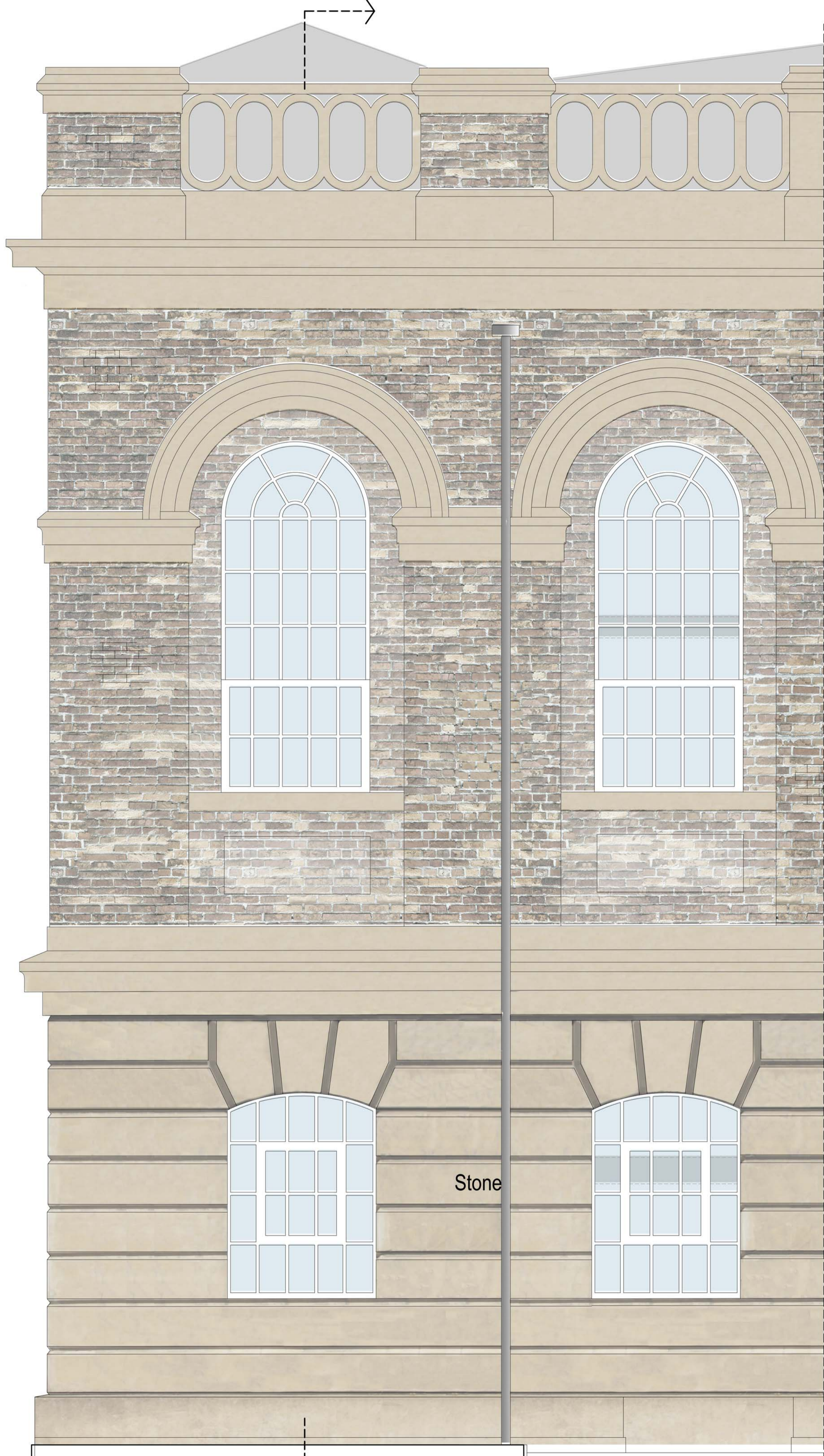
SCALE 1:25 Engine pump house Karslake Enlarged elevation