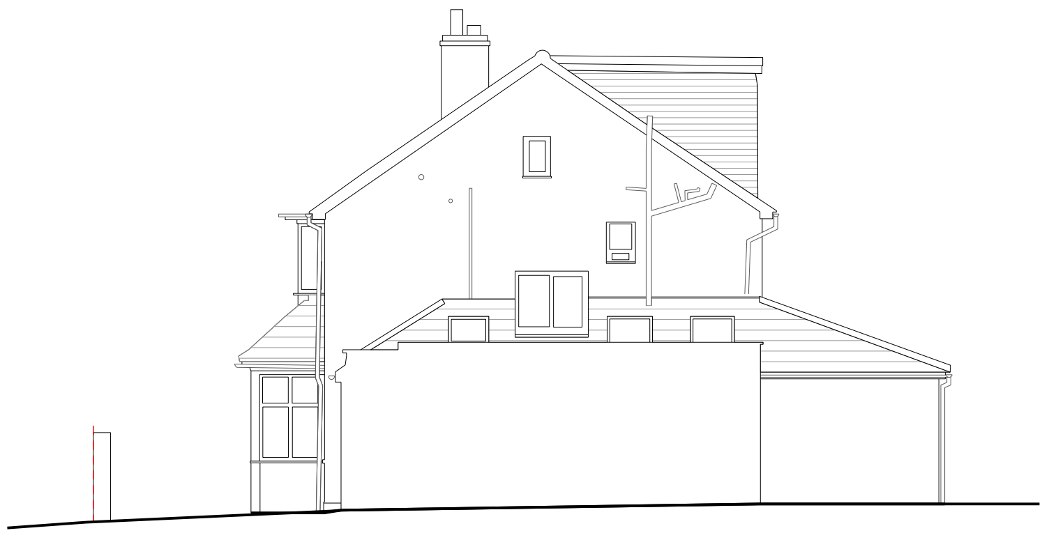
SIDE (NORTH) ELEVATION