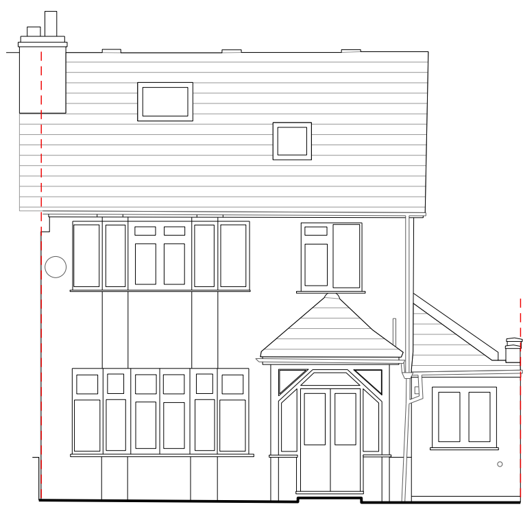
FRONT (EAST) ELEVATION

DO NOT SCALE FROM THIS DRAWING FOR ANY PURPOSE OTHER THAN PLANNING ASSESSMENT. ALL DIMENSIONS ARE TO BE CHECKED ON SITE PRIOR TO CONSTRUCTION. DIMENSIONAL DIFFERENCES TO BE CONFIRMED WITH THE ARCHITECT. SUBJECT TO BUILDING REGULATIONS AND STATUTORY APPROVALS THIS DRAWING IS TO BE READ IN CONJUNCTION WITH ALL CONSULTANTS INFORMATION. TE-A RETAIN THE COPYRIGHT OF ALL INFORMATION WITHIN THIS DRAWING. THIS DRAWING IS INTENDED ONLY FOR USE BY THE CLIENT NAMED BELOW AND ONLY IN RELATION TO THE PROJECT DETAILED BELOW. USE BY ANY OTHER PERSON AND/OR FOR ANY OTHER PURPOSE IS NOT PERMITTED WITHOUT THE EXPRESS WRITTEN PERMISSION OF TE-A TE-A IS A TRADING NAME OF: THOMAS EVANS ARCHITECTURE LTD 2 MINT STREET, GODALMING GU7 1HE Company No: 8455177 - Registered In England