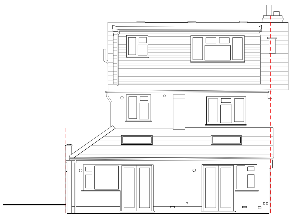
REAR (WEST) ELEVATION