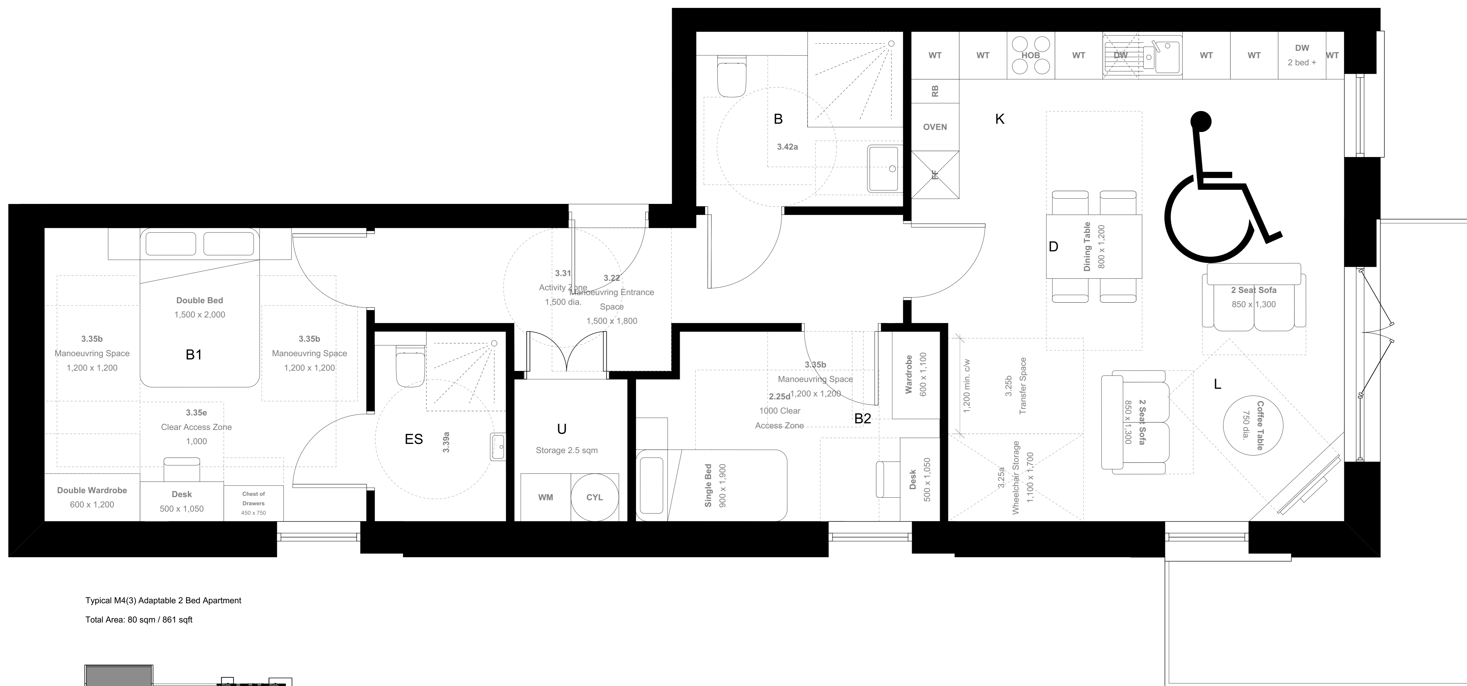
Typical M4(3) Adaptable 2 Bed Apartment Total Area: 80 sqm / 861 sqft

All information on this drawing is not for construction unless it is marked for construction.