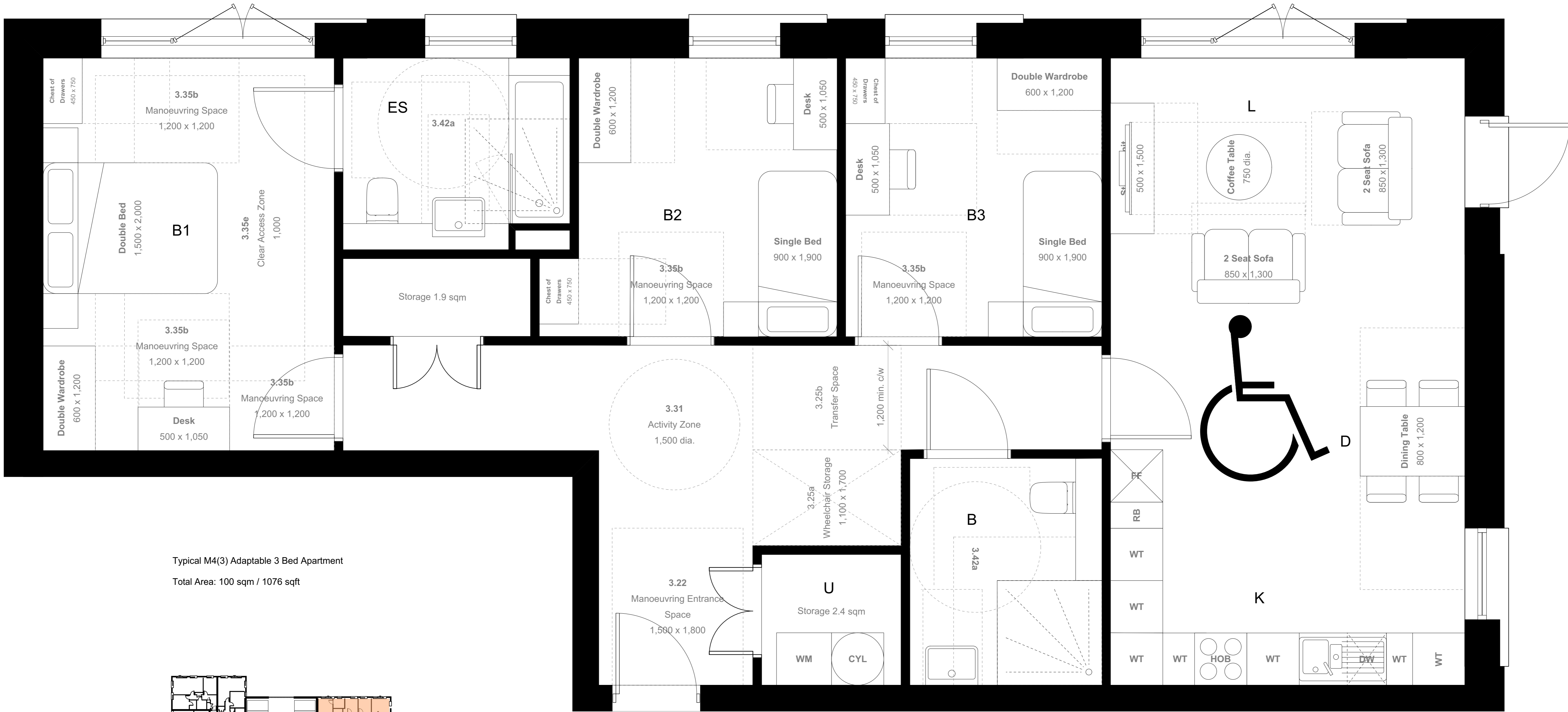
Typical M4(3) Adaptable 3 Bed Apartment Total Area: 100 sqm / 1076 sqft

+44 (0)20 7736 7744 info@assael.co.uk www.assael.co.uk