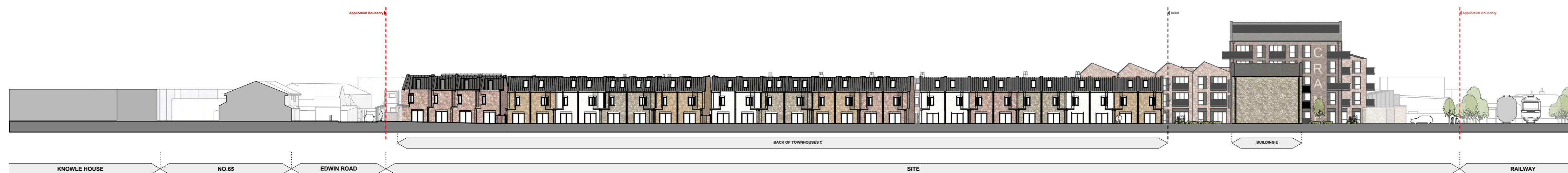
2 East Elevation Scale: 1:500