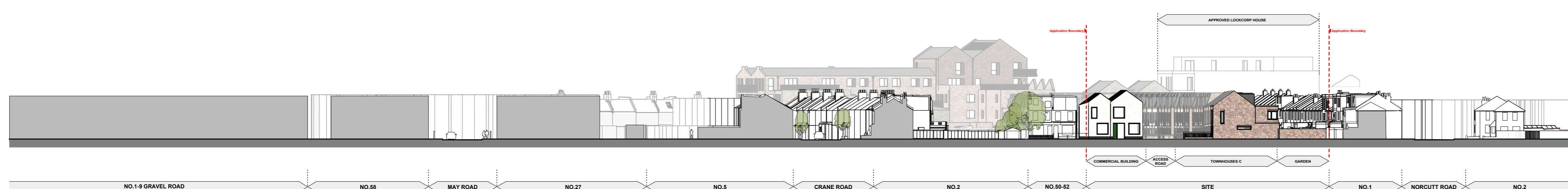
3 South Elevation Scale: 1:500