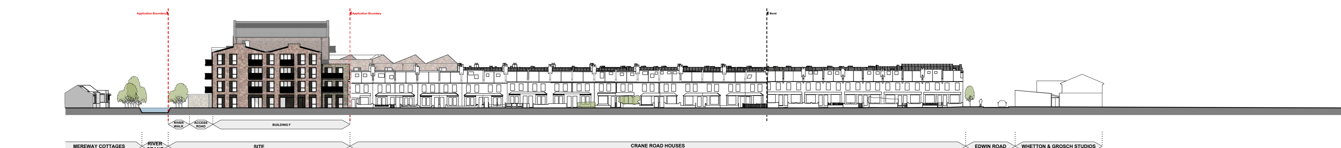
4 West Elevation Scale: 1:500