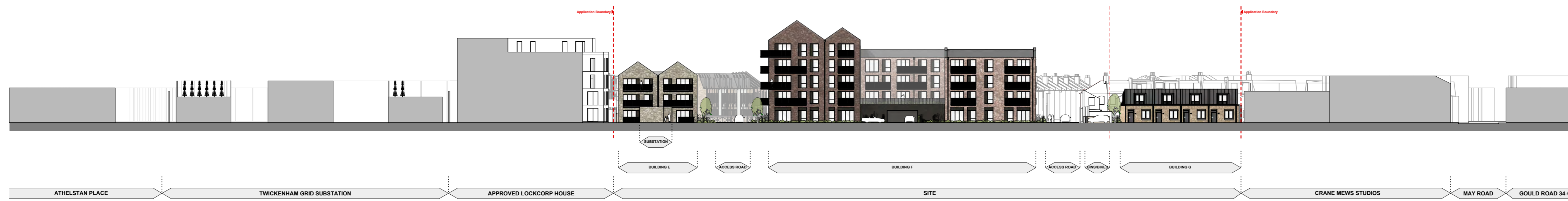
1 North Elevation Scale: 1:500

+44 (0)20 7736 7744 info@assael.co.uk www.assael.co.uk