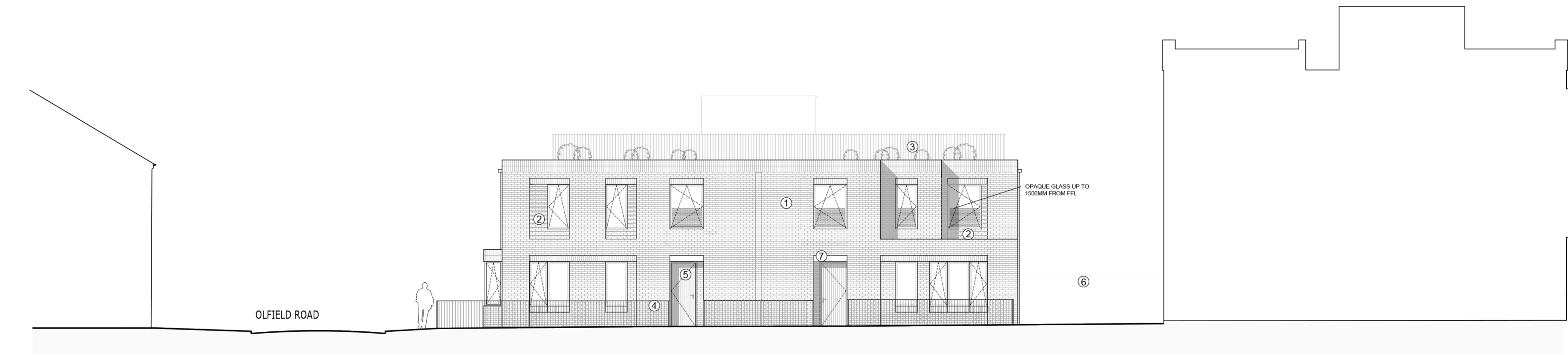
Proposed Elevation DD