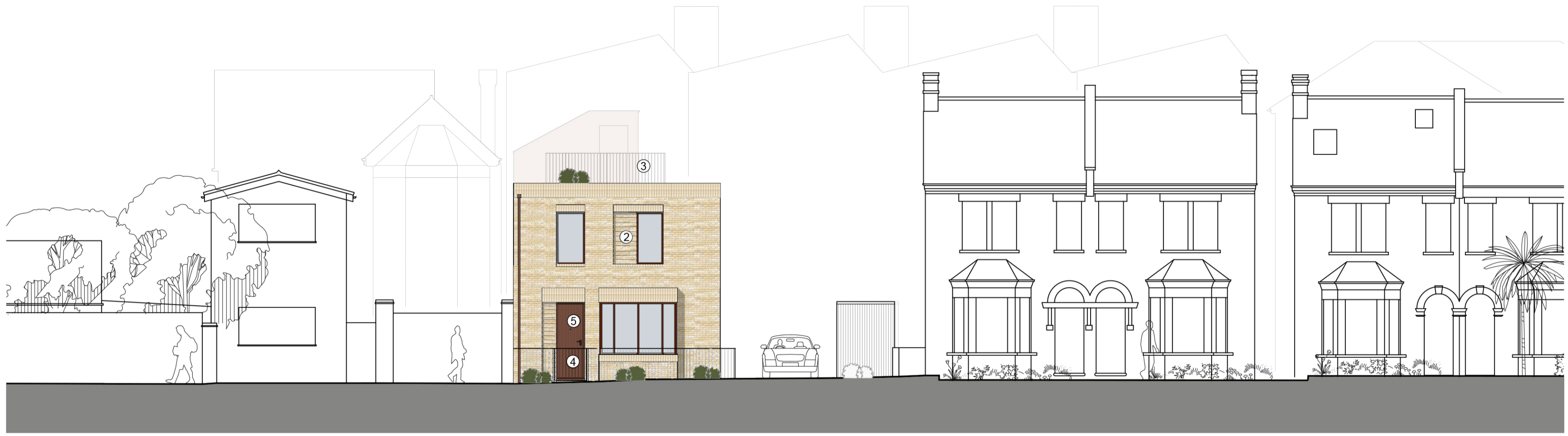
Oldfield Road Elevation BB