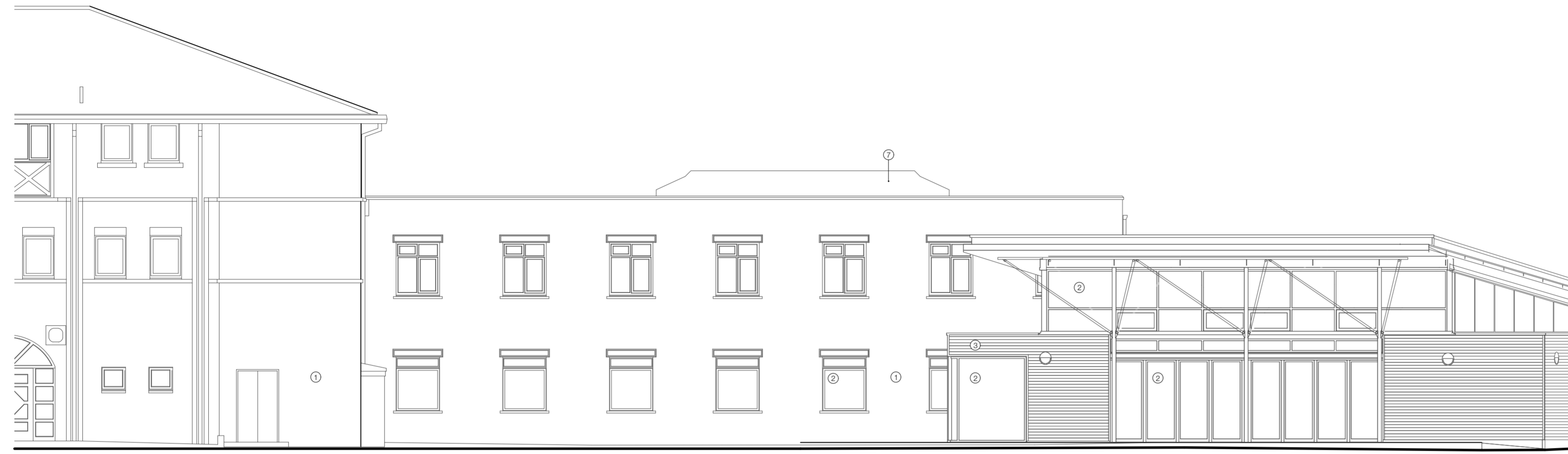
01 Existing East Elevation Scale: 1:100

J Block, Jii Block, Cafe & Library plans & elevations from Measured Building Survey by Berry Geomatics 16.07.2019 Theatre & NI Block plans & elevations from drawings prepared by Client 16.04.2020