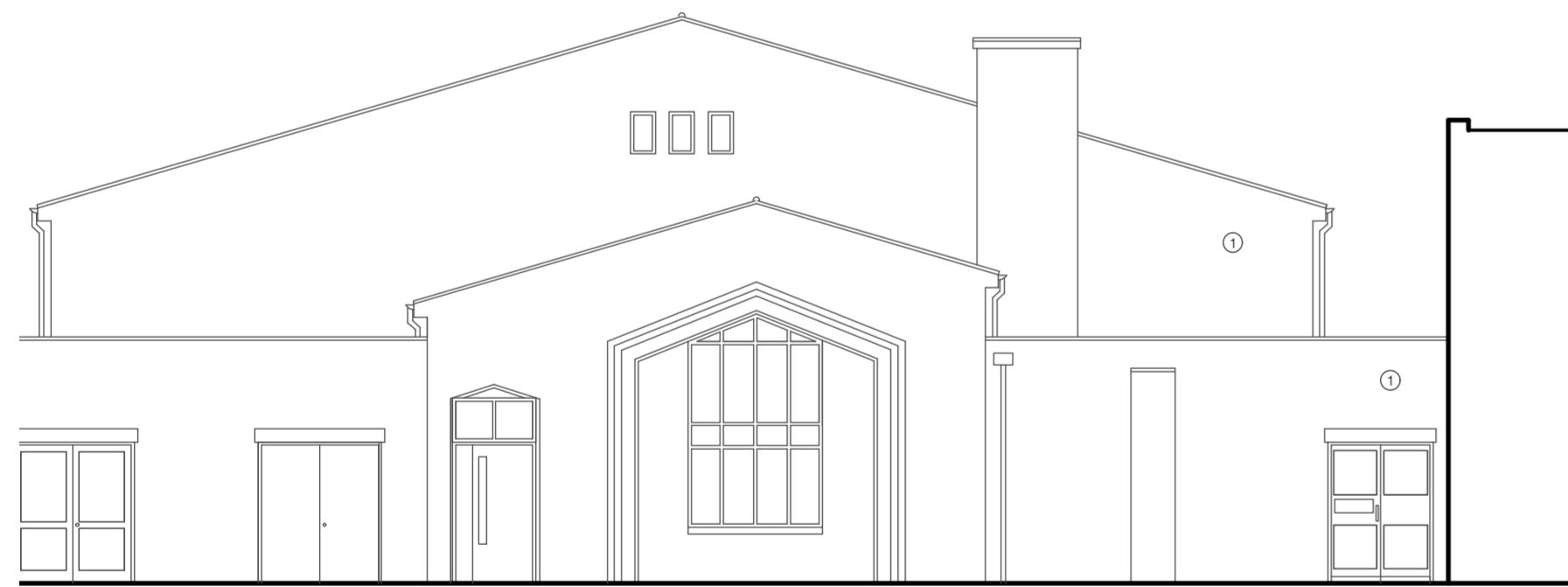
03 Existing South Elevation Scale: 1:100