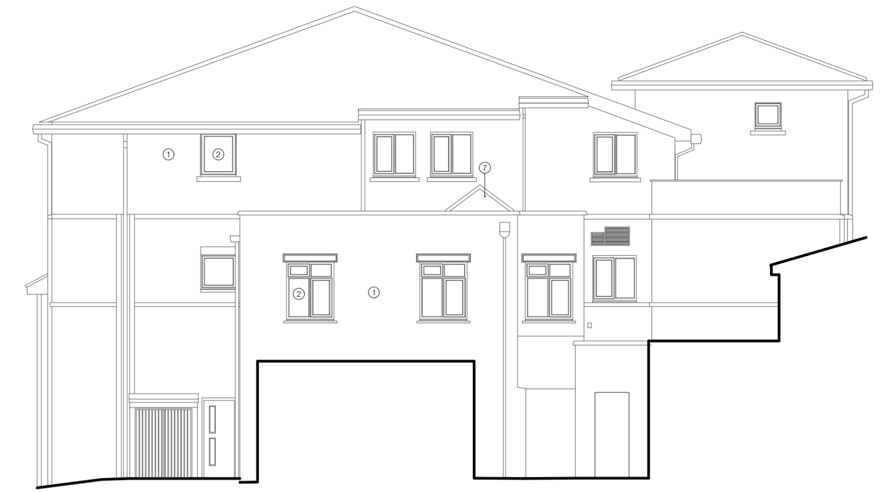
02 Section Z-Z & North Elevation - Existing Scale: 1:100