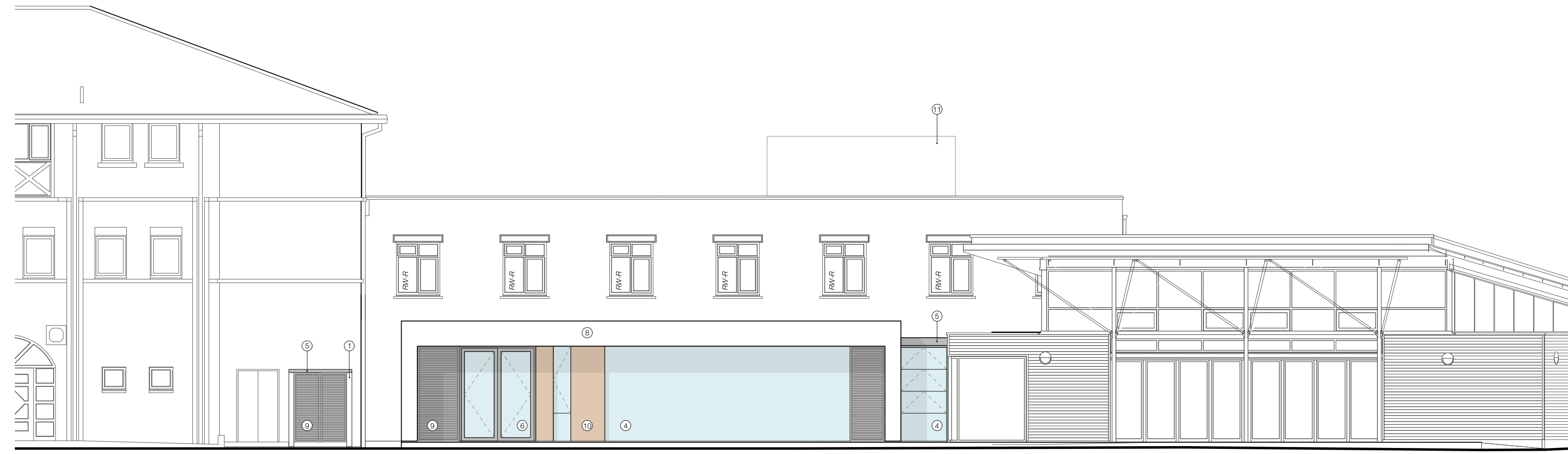
01 Proposed East Elevation Scale: 1:100

J Block, Jii Block, Cafe & Library plans & elevations from Measured Building Survey by Berry Geomatics 16.07.2019 Theatre & NI Block plans & elevations from drawings prepared by Client 16.04.2020