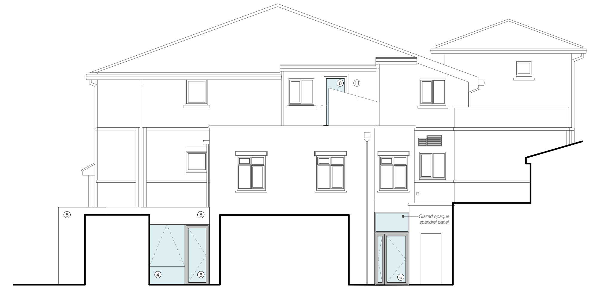
02 Section Z-Z & North Elevation - Proposed Scale: 1:100